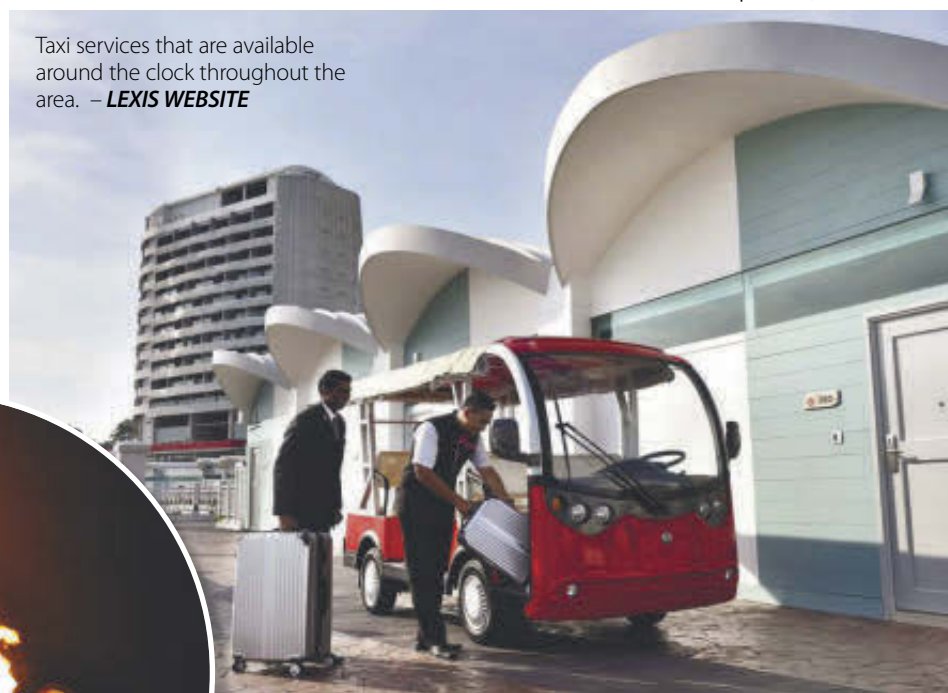
Taxi services that are available around the clock throughout the area. – LEXIS WEBSITE