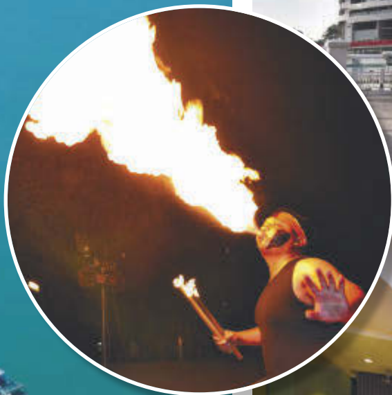
A wonderful fire show display by the Lexis team. – BUZZ TEAM

Perfect resort for a wholesome weekend getaway