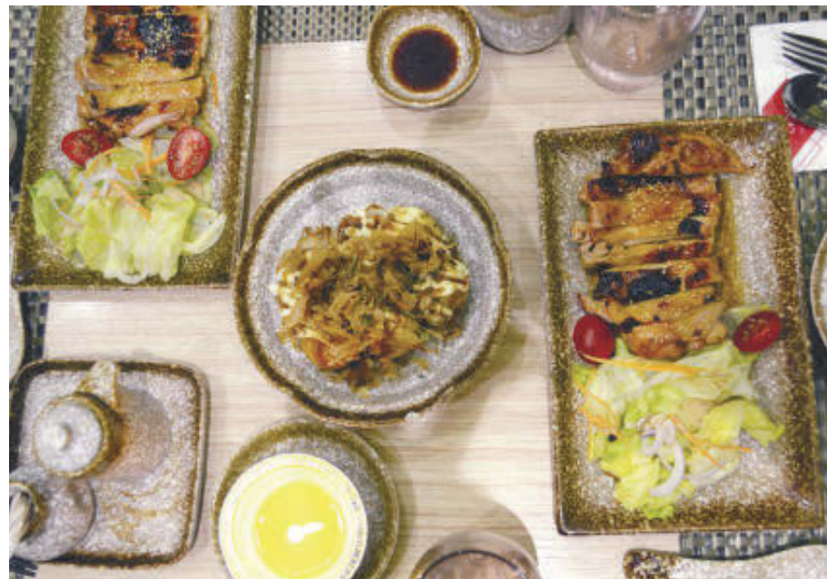
UMI Japanese Restaurant's avant-garde environment emphasises taste, presentation, and freshness. UMI, which means "sea" in Japanese, serves Japanese classics. - O/WN