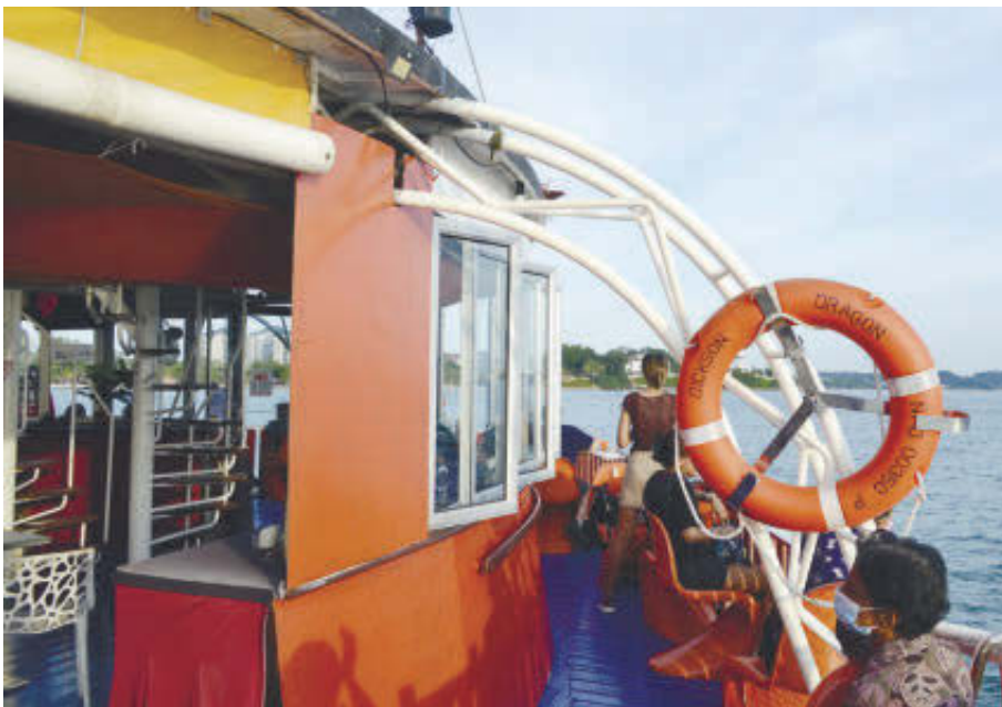
DSC 0283 - Departure from PD World Marina, guests can either travel on their own or arrange a booking transportation.

After that, we had a leisurely boat cruise for fifteen minutes to experience Port Dickson's natural seascape from a new vantage point. This allows us to see the area's seascape from