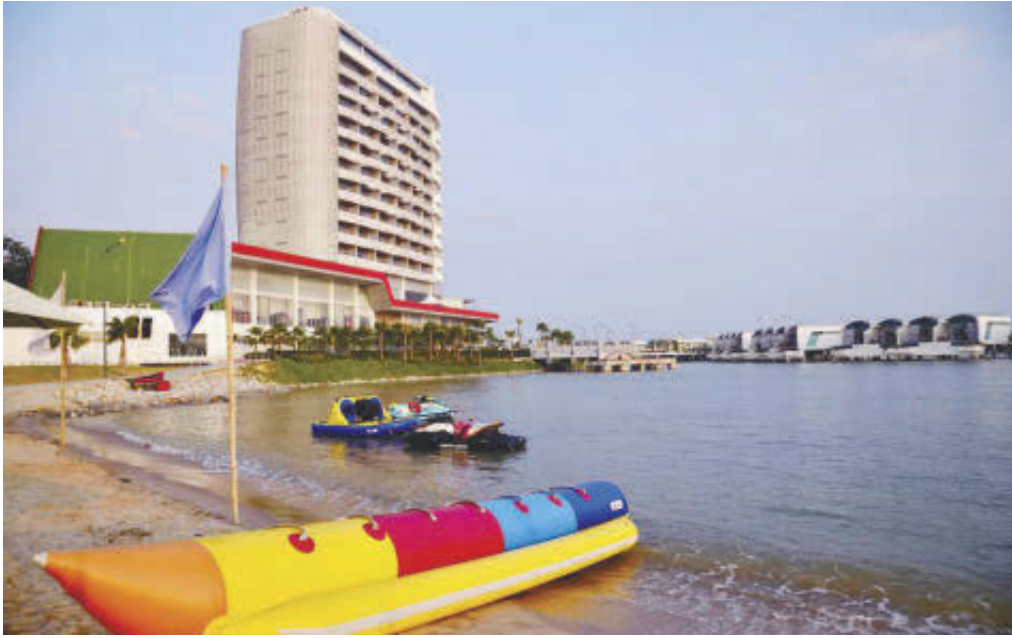
Lexis Web 1 - Don't forget to take part in some adrenaline-pumping water activities here. - LEXIS WEBSITE