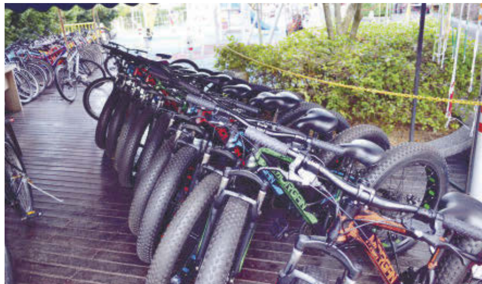
Biking the Lexis Hibiscus is the perfect way to experience the area. Rent a bike and ride through the extensive grounds. – BUZZ TEAM

Whether you're travelling with family or going on a honeymoon, you'll be sure to wind down and reset after a weekend getaway in Lexis Hibiscus Port Dickson with their in-house restaurants, entertainment, and recreational activities.