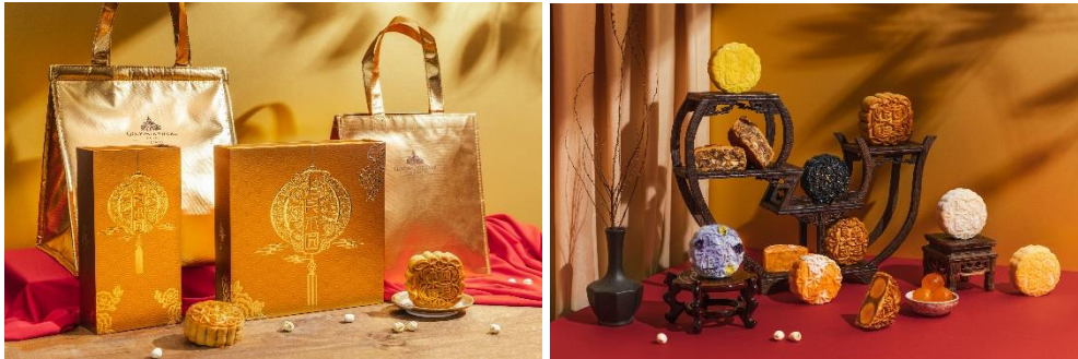
Goodwood Park Hotel Signature and Popular Mooncakes

Singapore, July 2023 – This upcoming Mid-Autumn Festival, Goodwood Park Hotel's luminous line-up of inventive and traditional Mid-Autumn Grandeur creations will set the perfect mood for a blissful reunion with friends, family and loved ones.