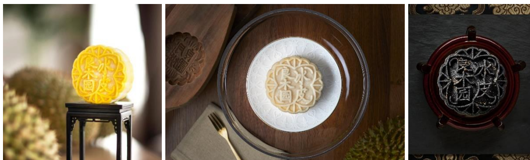
From L – R: D24 Durian Snowskin Mooncake, 'Mao Shan Wang' Durian Snowskin Mooncake, Black Thorn Durian Snowskin Mooncake

Available for takeaway at The Deli and via Festive Online Shop