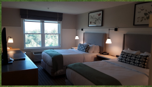
Newly renovated guest rooms