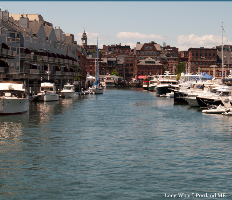
Long Wharf, Portland ME