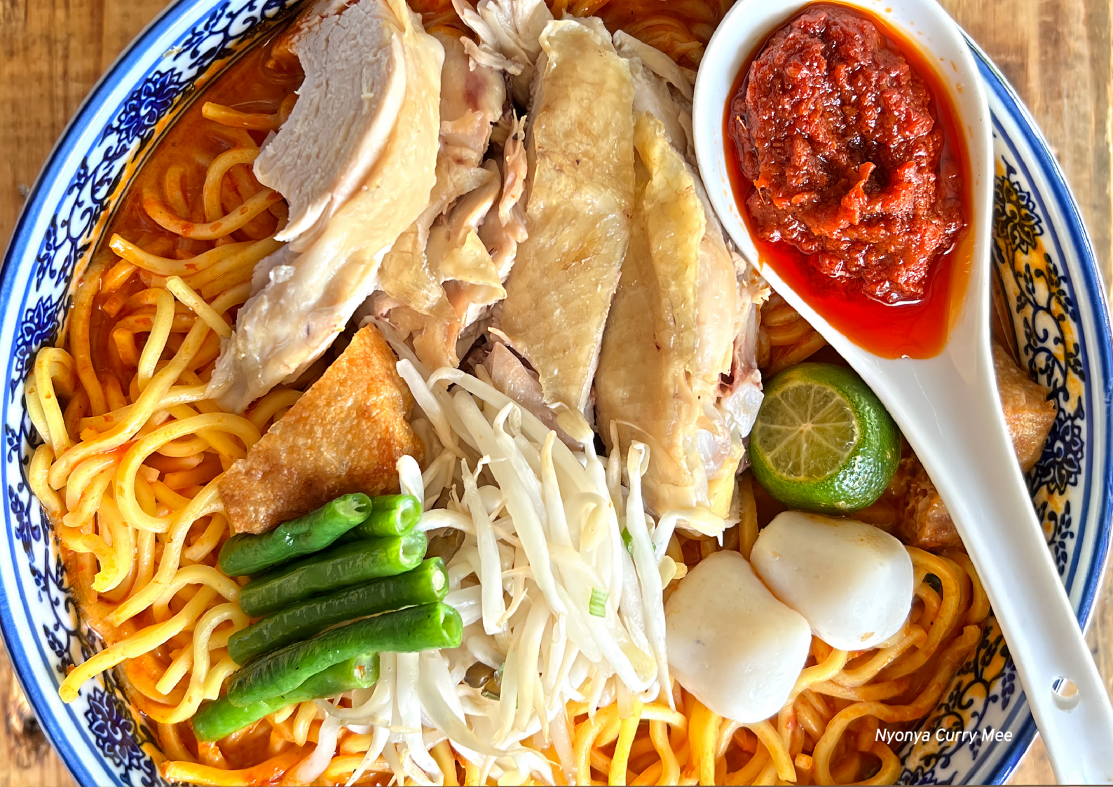
Nyonya Curry Mee