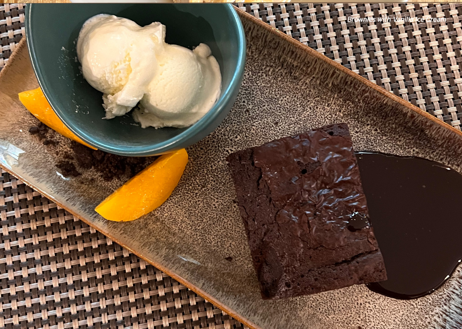
Brownies with Vanilla Ice Cream