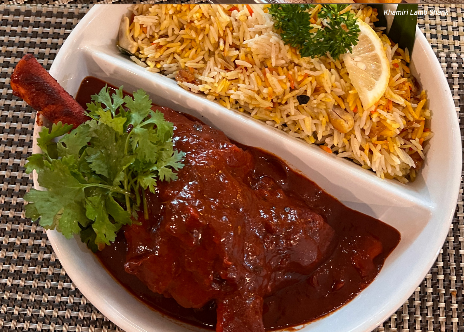
Khamiri Lamb Shank