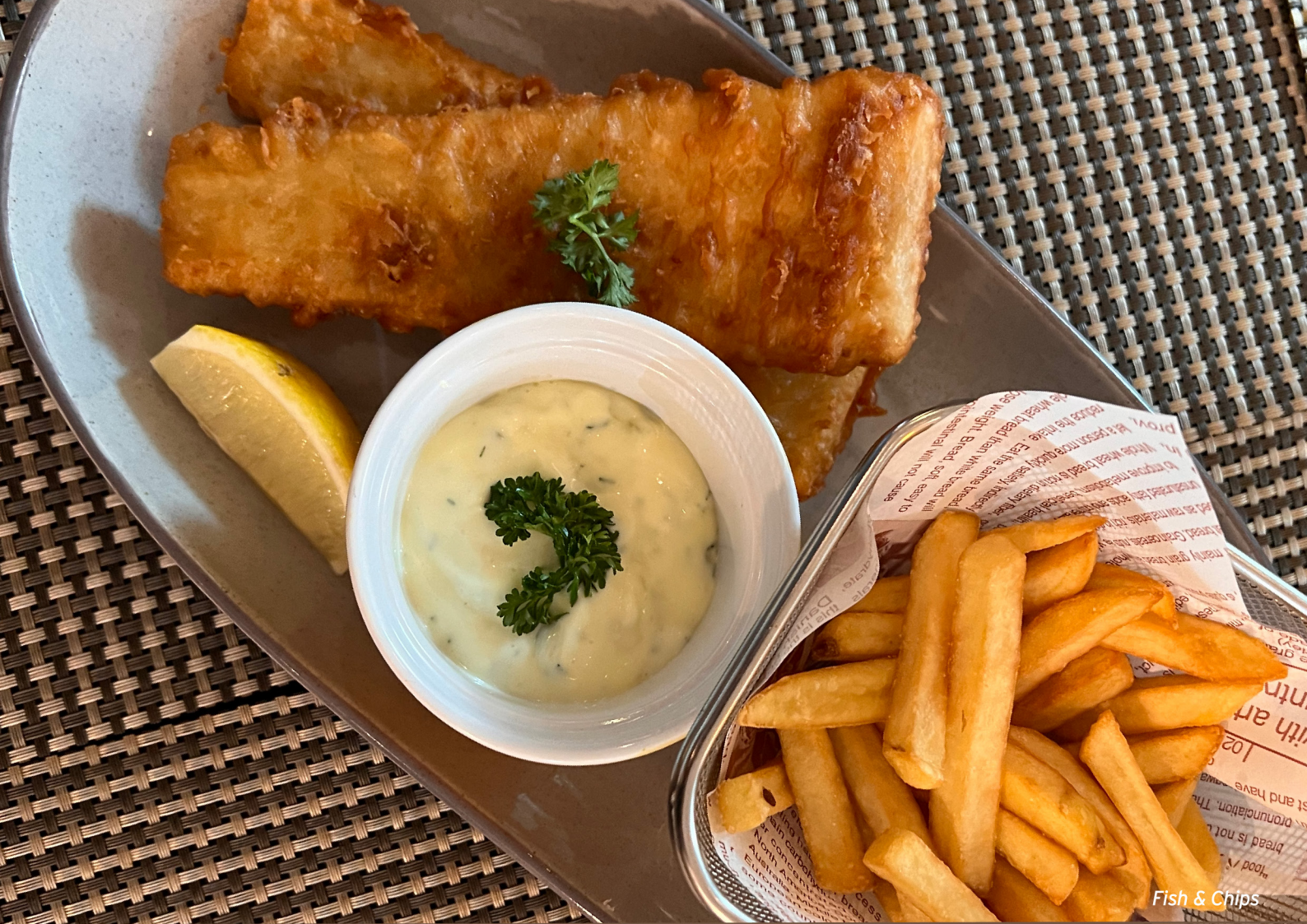
Fish & Chips