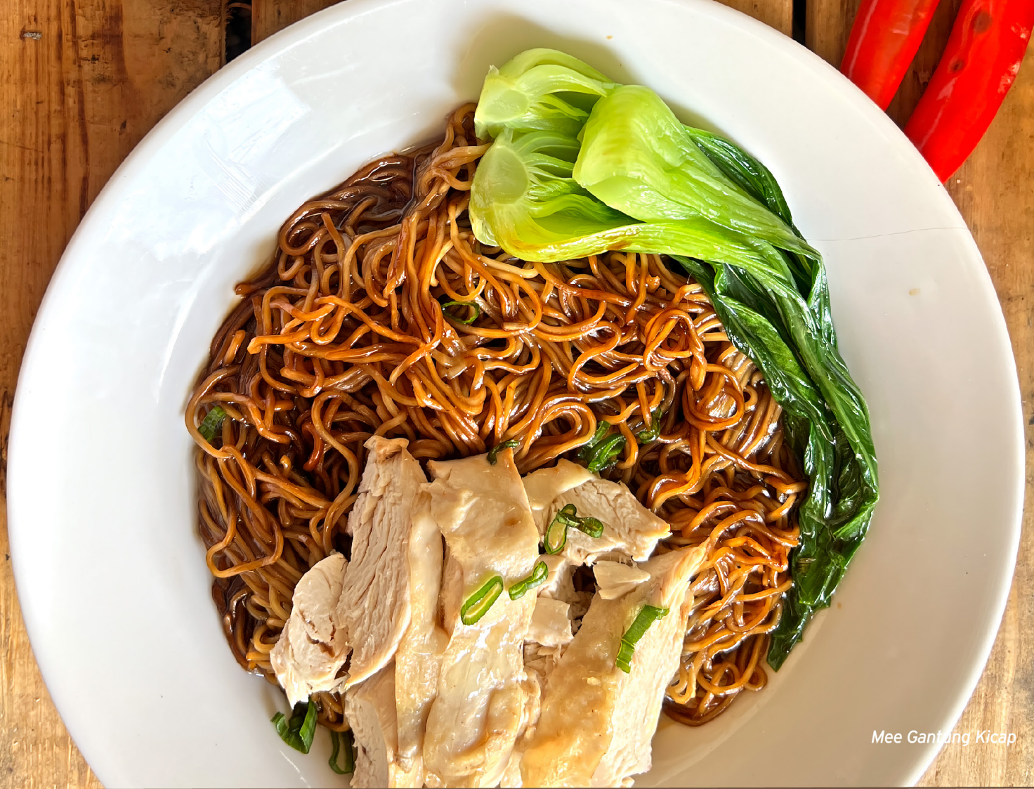
Mee Gantang Kicap