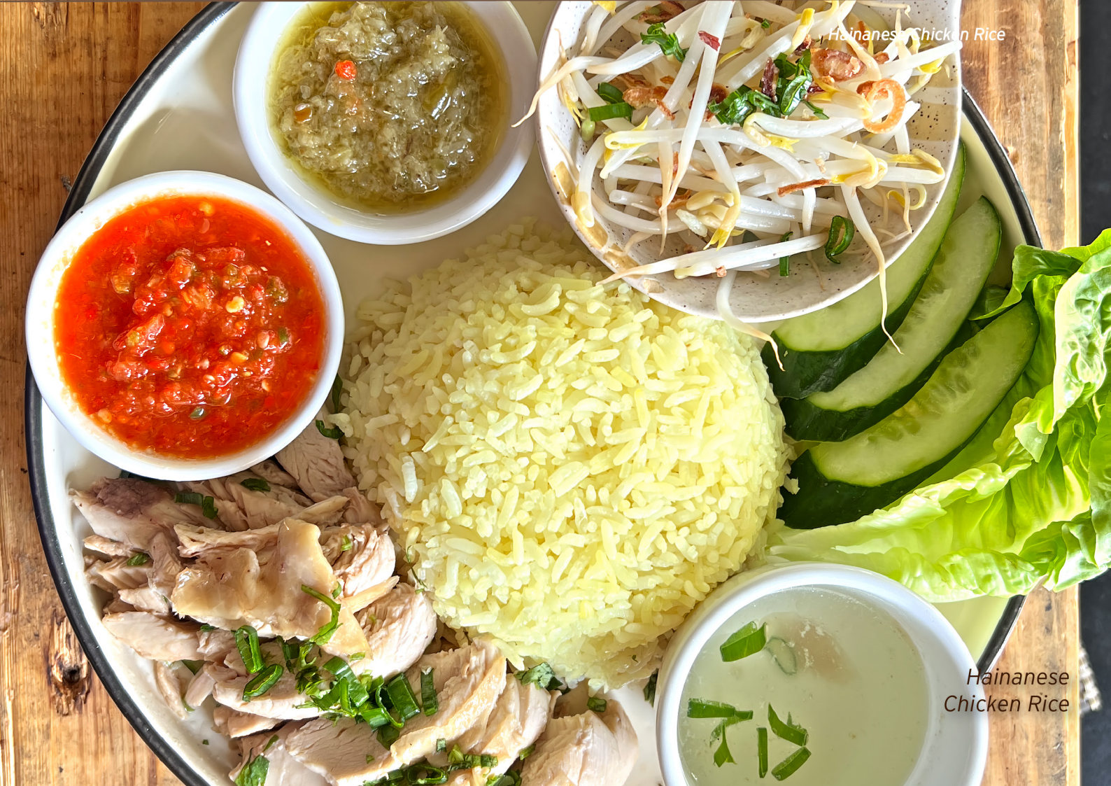
Hainanese Chicken Rice