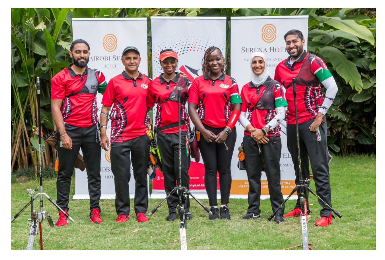
Kenya National Archery Team