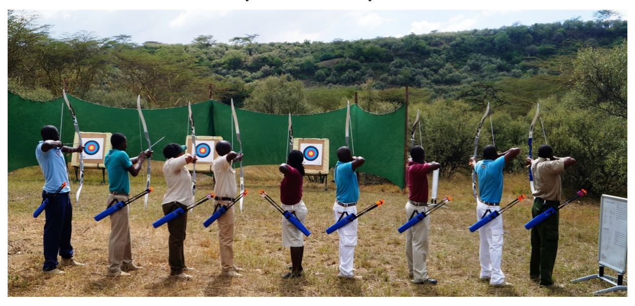
Archery Range and Equipment at Serena Hotels