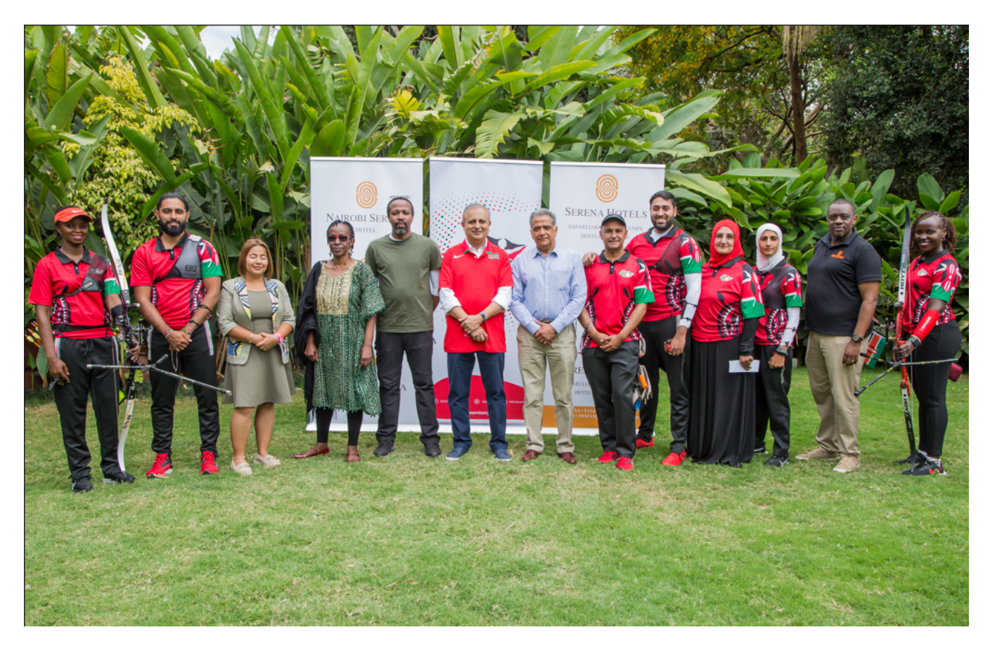
Kenya National Archery Team together with Serena Hotels' Management