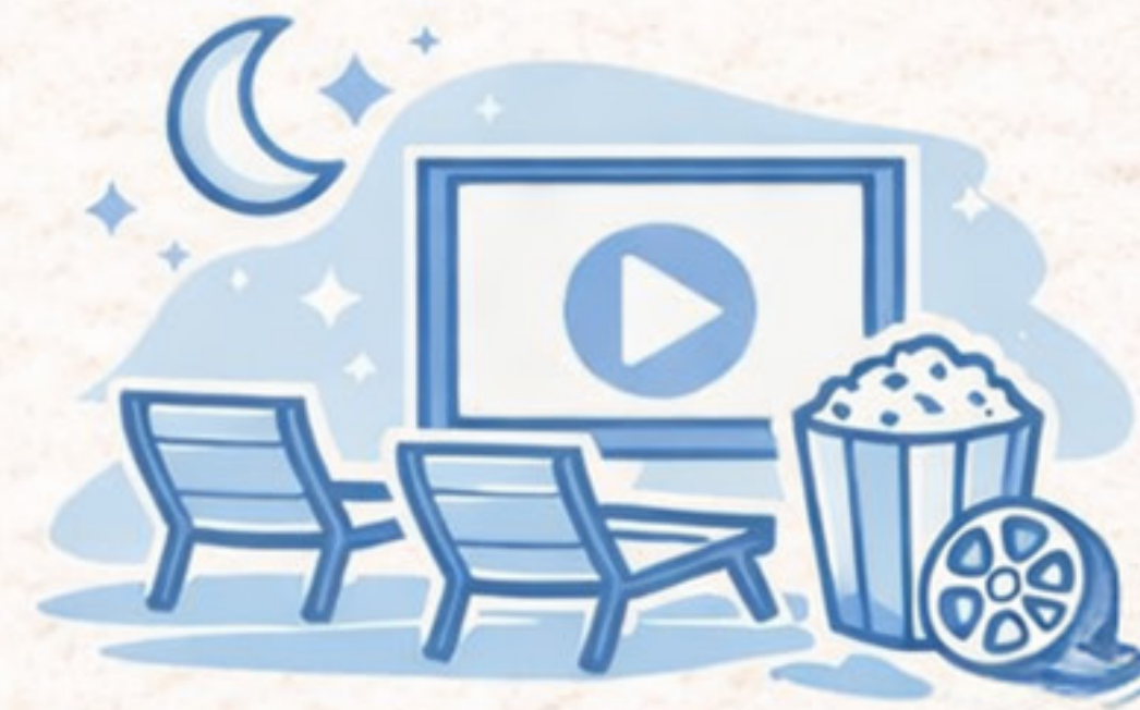
Evening Entertainment & Movie Night