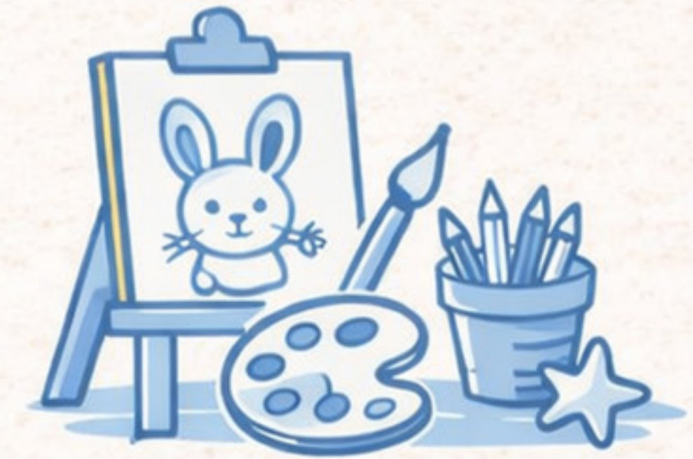
Creative Kids' Workshops