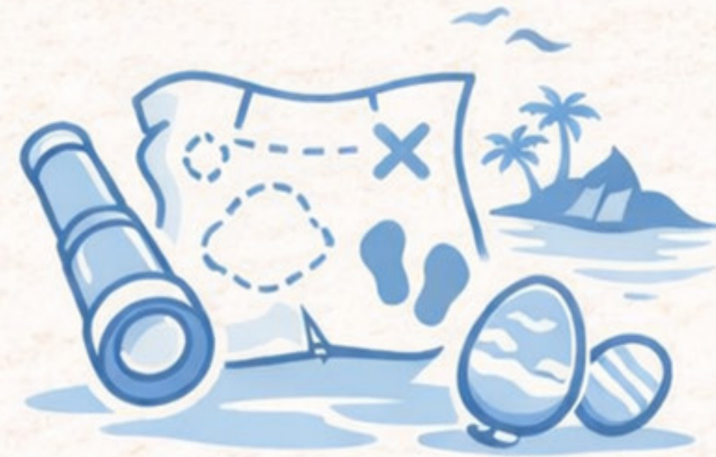
Family Scavenger Adventures