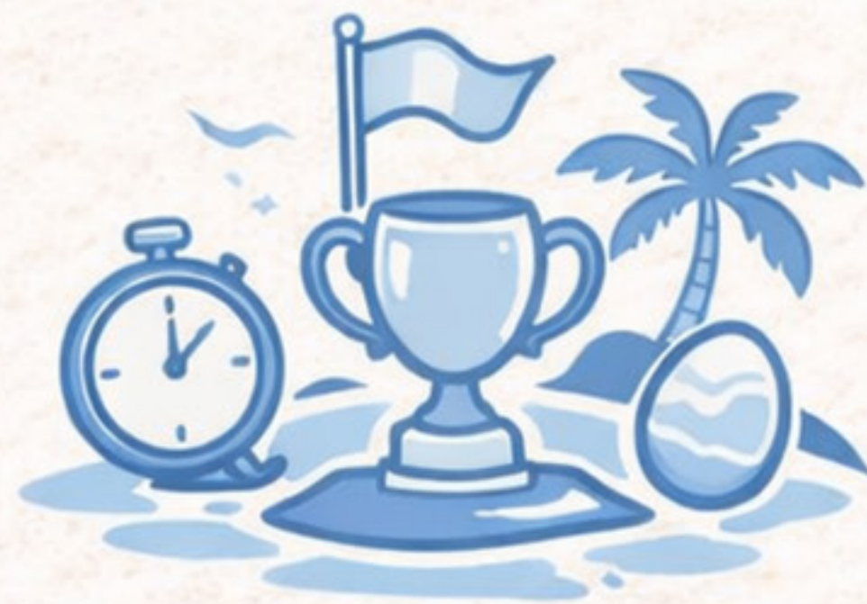
Teen & Adult Challenges