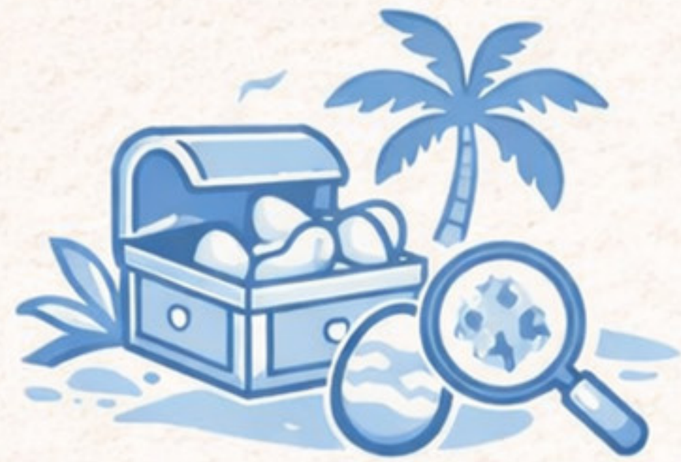
Island-wide Easter Egg Hunt