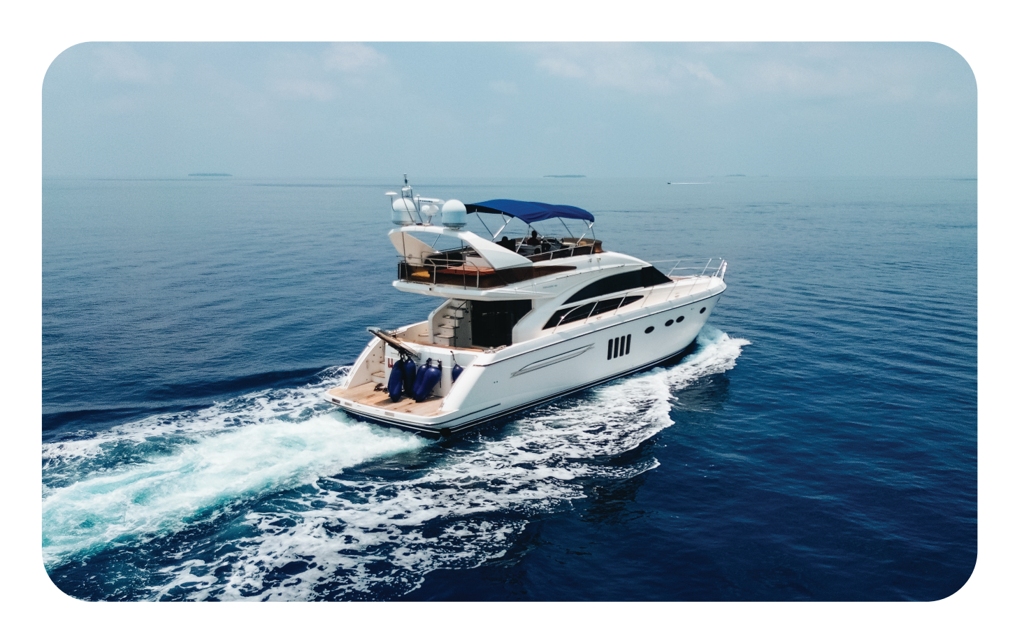
All mentioned prices are subject to 10% service charge and 16% GST. Terms and conditions applicable.

90-minute sessions from our curated menu of indulgent treatments