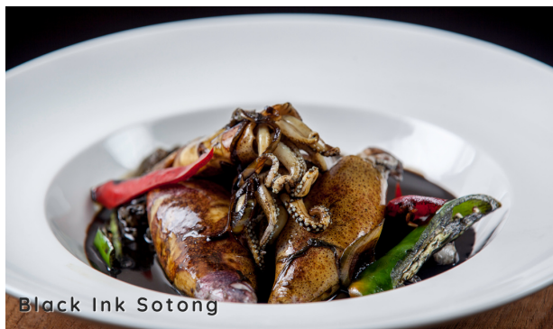
Black Ink Sotong

prawn, squid, black mussels, clams, curry gravy