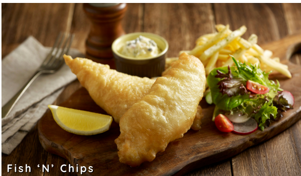
Fish 'N' Chips

angus beef patty, brioche bun, bacon, cheddar cheese, caramelised onions, fries, salad