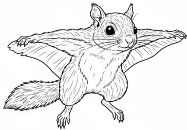
Northern Flying Squirrel

Northern Flying Squirrels use a furry skin membrane called a patagium that stretches between their wrists and ankles, they can glide over 100 feet from trees to evade predators, steer with their tails, and actually glow neon pink under UV light.