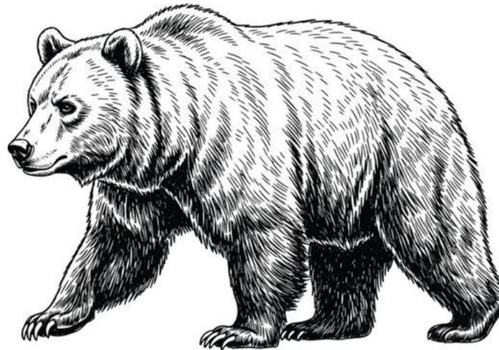
American Black Bear

Although large animals, black bears are surprisingly quick and agile. They can sprint up to 35 miles per hour and climb 100 feet up a tree within 30 seconds.