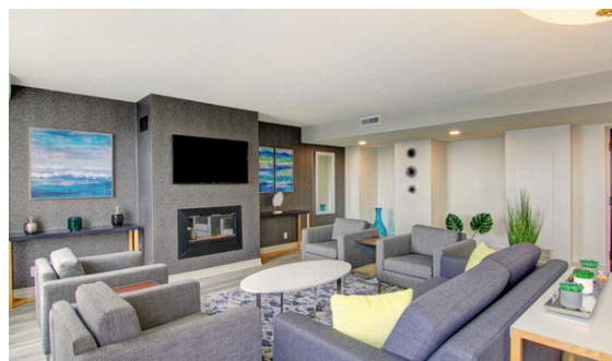
THE PARK SUITE