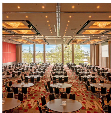
Grand Ballroom meeting space for up to 1,400 guests.