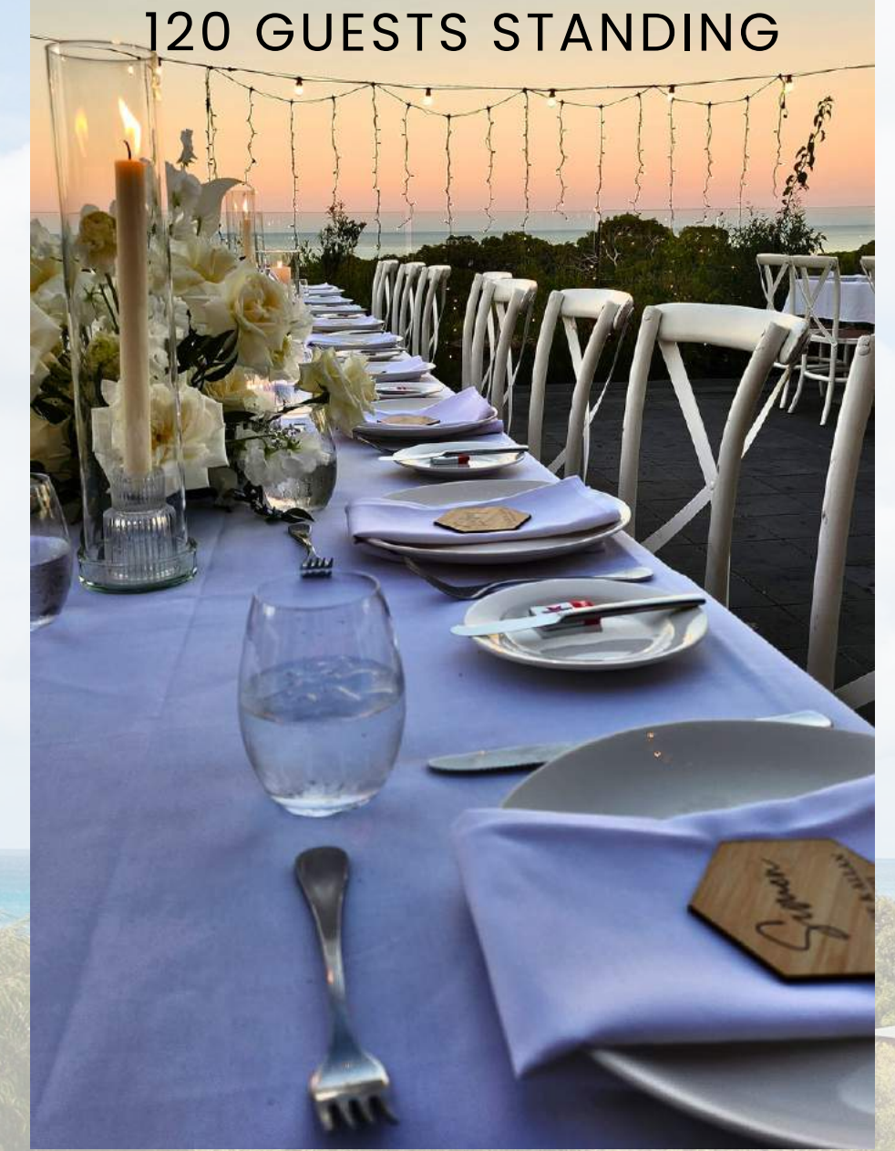
The ultimate outdoor venue for unsurpassed ocean views