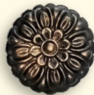
Coconut salted egg lava