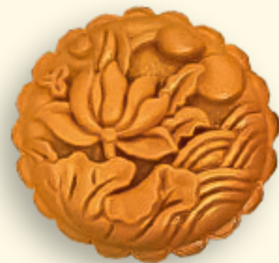
Seafood mixed nuts with XO sauce