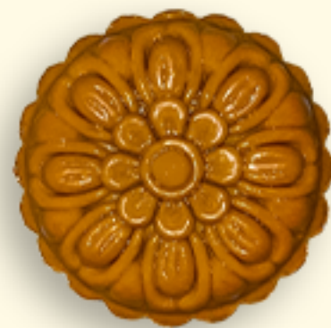
Truffle beef mixed nuts