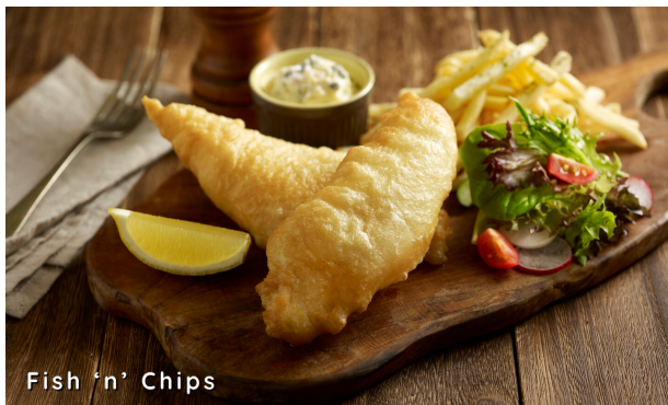
Fish 'n' Chips

angus beef patty, brioche bun, bacon, cheddar cheese, caramelised onions, tomato slice, lettuce, fries, salad