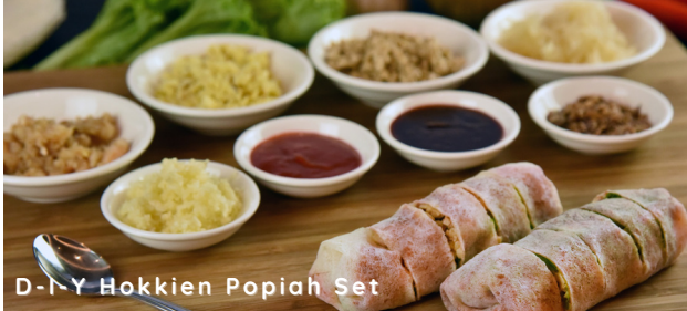
D-I-Y Hokkien Popiah Set