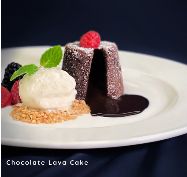
Chocolate Lava Cake

Tropical Fruit Platter / S$12 assortment of seasonal fresh fruits