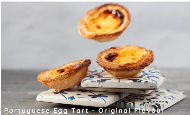
Portuguese Egg Tart - Original Flavour