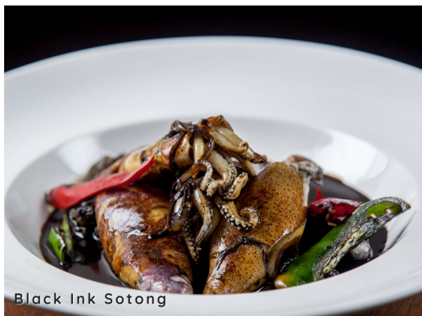
Black Ink Sotong

poached squid, smoky spicy squid ink gravy, green chillies, red chillies, sliced onions, garlic