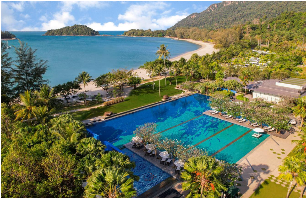
The Danna Langkawi's Infinity Pool overlooking the Andaman Sea

LANGKAWI, MALAYSIA - The Danna Langkawi, a distinguished member of Small Luxury Hotels of the World promises to offer elevated experiential getaways with Langkawi's peaceful, coastal surroundings providing a serene backdrop that perfectly harmonizes with the resort's luxurious offerings. After 13 years since The Danna Langkawi opened its doors to guests, it has recently completed phase one of its room refurbishment exercise resulting in 51 exquisitely refurbished rooms and suites. Also included was a conversion of 6 studio rooms into 2 new two-bedroom suites. More than just a place to stay, The Danna Langkawi promises an unforgettable journey immersed in graceful old-world charm.