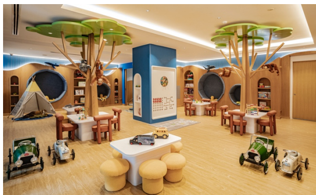
All New The Danna Jr. Club