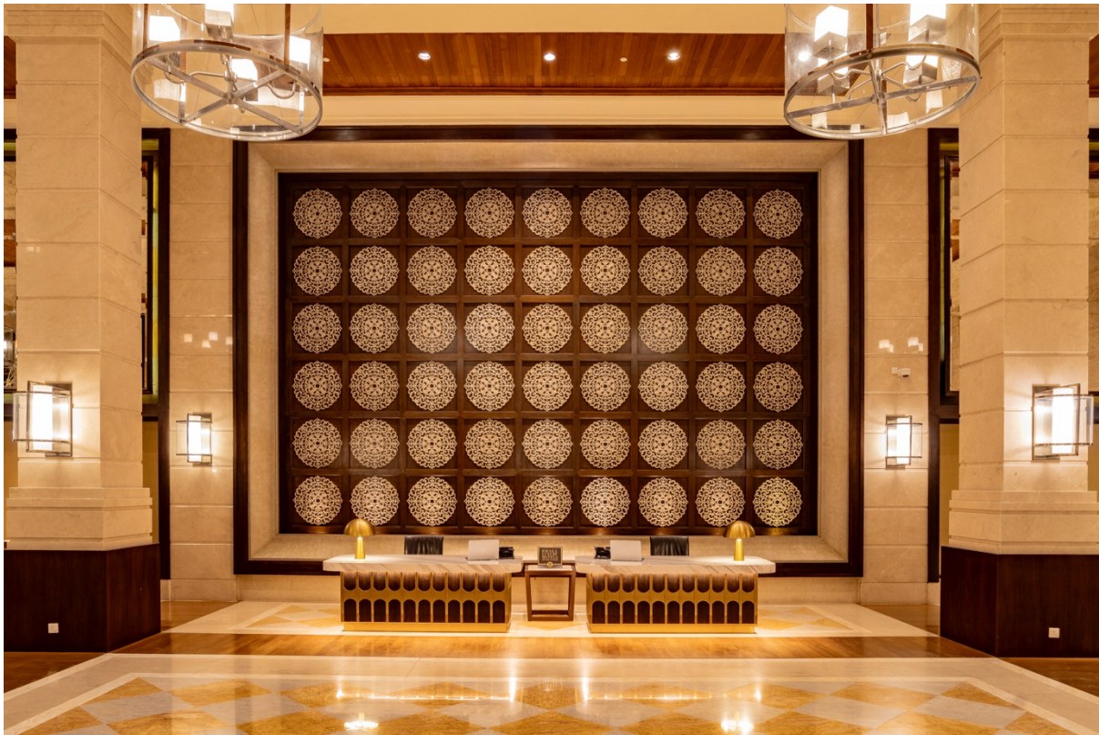
The Danna Langkawi's Refreshed Grand Lobby

The first phase of refurbishment aims to maintain the essence of the resort and infuse a refreshed and relevant level of luxury that modern travellers have come to expect. Whilst the original structure and layout of the rooms remain, the bespoke furnishings now reflect a softer silhouette, lighter colours and all new fabrics that focus on quality and comfort.