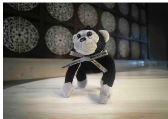
The Danna Jr. Langur

The Danna Langkawi's rooms refurbishment has unlocked a new level of adventure and entertainment with its all-new The Danna Jr. Club. Available for children ages 4 to 11 years old, The Danna Jr. Club features a robust schedule of events and experiences such as supervised crafts, engaging sports activities, fish feeding sessions, interactive board games, and more to keep the little ones entertained while parents can unwind and explore the resort at their leisure.