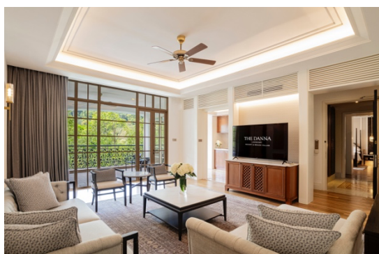
All New Grand Merchant 2-Bedroom Suites

bedroom suites by the end of Phase 2 of the refurbishment. The second phase of refurbishment works for remaining 74 rooms are expected to commence in April 2024 and targeted to be completed by end of June 2024.