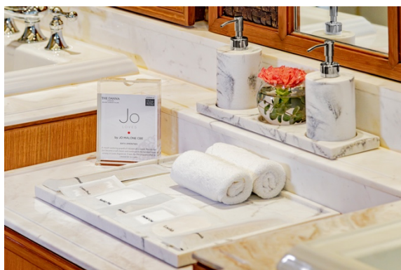
Sustainable bath amenities