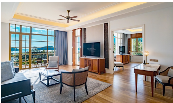
Newly refurbished Countess Sea View Suites

The design is a continuation from the lobby where the “colonial journey” can be experienced from the moment you walk into the grand lobby of The Danna to the newly refurbished room.