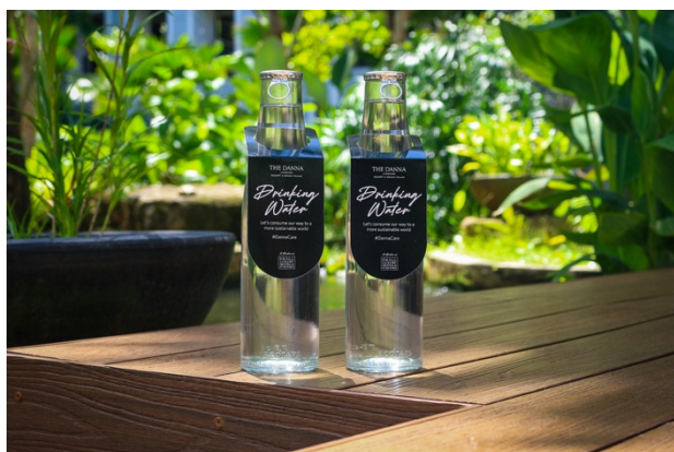
#DannaCare – In-house water bottling plant