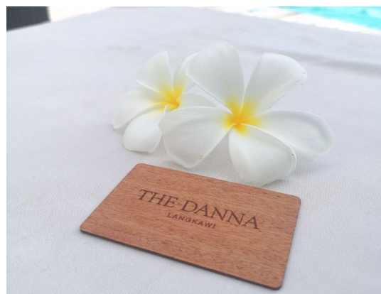
#DannaCare – Wooden Key Cards

In keeping with The Danna Langkawi's commitment to sustainable luxury, #DannaCare initiatives are introduced to further align their dedication. Under this initiative, all single-use plastics have been removed from the rooms. Oversized containers for shower gel, shampoo, and conditioner have also been introduced. Additionally, in-room water amenities for guests come from the resort's very own new Water Bottling plant. The Danna aims to offer guests a comprehensive and environmentally conscious experience. This represents a significant stride in the ongoing commitment of The Danna Langkawi towards fostering sustainability and responsible practices in the realm of hospitality.