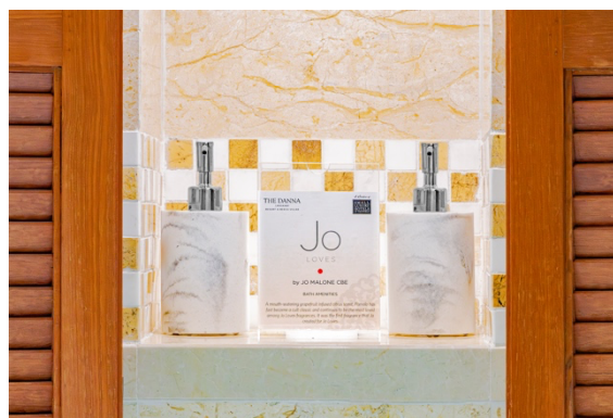
Premium Jo Loves by Jo Malone CBE Bath Amenities

There's even more good news for guests who love exclusive beauty products. The Danna Langkawi is proud to be the first hotel in Malaysia to carry the coveted Jo Loves by Jo Malone CBE, a bespoke line of body care and hair care amenities in oversized bathroom dispensers. The newly refurbished rooms will be installed with the Pomelo collection, featuring scent notes of Pomelo, Vetiver and Suede, for guests to enjoy and use during their stay.