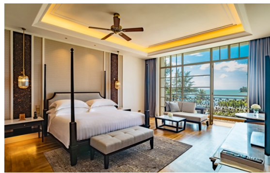
Newly refurbished Viceroy Sea View

The Danna Langkawi embodies uncompromising luxury and is known for its spacious suites with amazing views. Hence 4 more two-bedroom suites will be added with a generous floor space of 210 sqm. This enables the resort to have a total of 16 suites, ranging from 1 bedroom, 2 bedroom and 3-