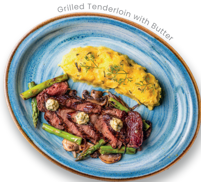
Grilled Tenderloin with Butter