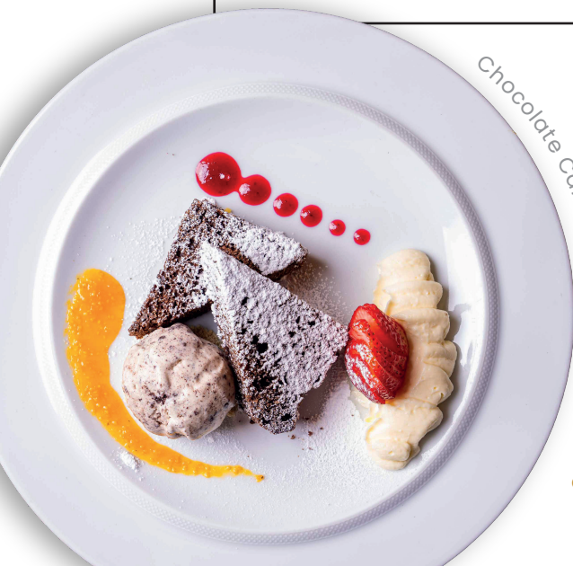
Chocolate Cake with Ice Cream