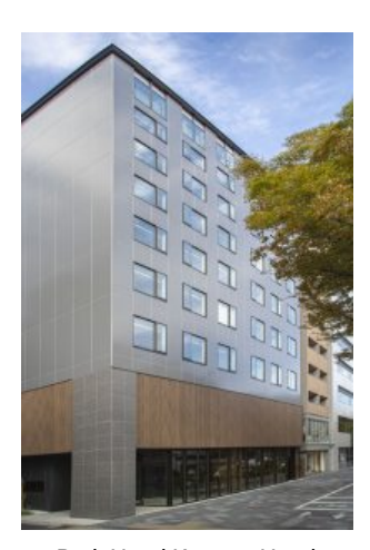
Park Hotel Kyoto – Hotel Facade

In celebration of its opening, Park Hotel Kyoto is extending an opening offer for guests to enjoy up to 40% off Best Flexible Rates when they book and stay from March 16 till June 30, 2021 inclusive. Terms and conditions apply. Visit parkhotelgroup.com/kyoto for more details.