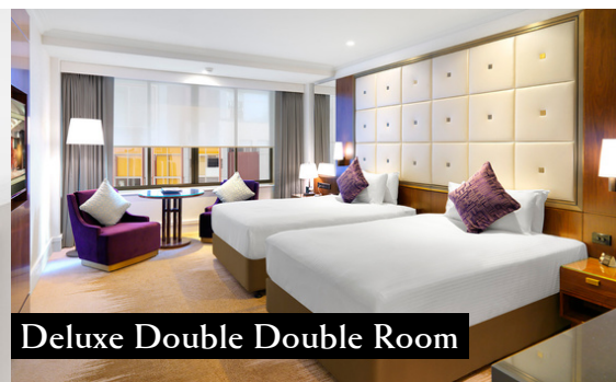
Deluxe Double Double Room