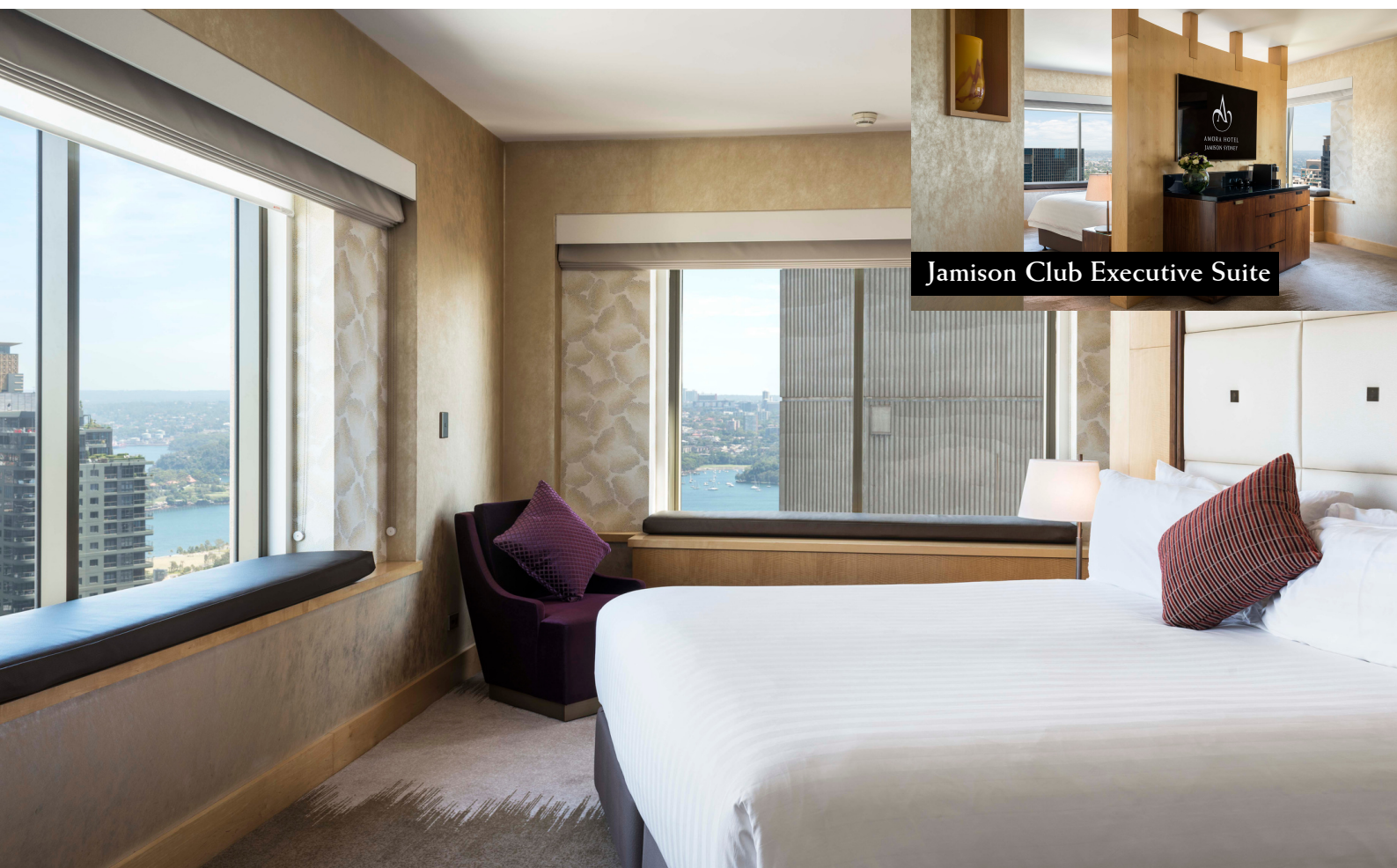
Jamison Club Executive Suite