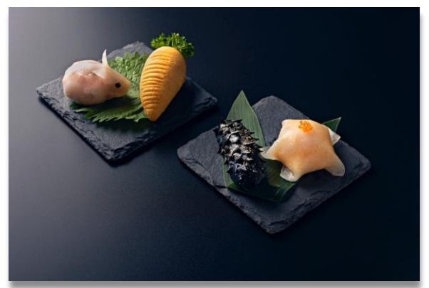
Min Jiang Land and Sea Quartet

The menus are curated with new creations, signatures and house specialities. During lunch, Min Jiang carries on the tradition of featuring a dim sum pushcart service – a classic offering seldom found in Chinese restaurants these days. A new range of hand-made dim sum has been introduced such as the Steamed Pumpkin Ball 金果素饺, Deep-fried Homemade Squid Tofu with XO Sauce XO 酱炸豆腐, and Deep-fried Bacon Roll with Enoki Mushrooms and Prawns 烟肉鲜虾 卷 that will be popular with diners of all ages. The creatively presented Min Jiang Land and Sea Quartet 岷江点心四拼 features a rabbit-shaped Steamed Prawn and Carrot Dumpling 蒸小白兔饺 accompanied by Deep-fried Pork 'Char Siew' and Pine Nuts in Glutinous Pastry 脆皮萝卜仔 fashioned like a carrot. Alongside are a Steamed Squid and Sea Cucumber Dumpling 蒸黑刺参饺 and Steamed Prawn and Chinese Stem Lettuce with Tobiko Dumpling 水晶海星饺 formed like a sea cucumber and starfish respectively.