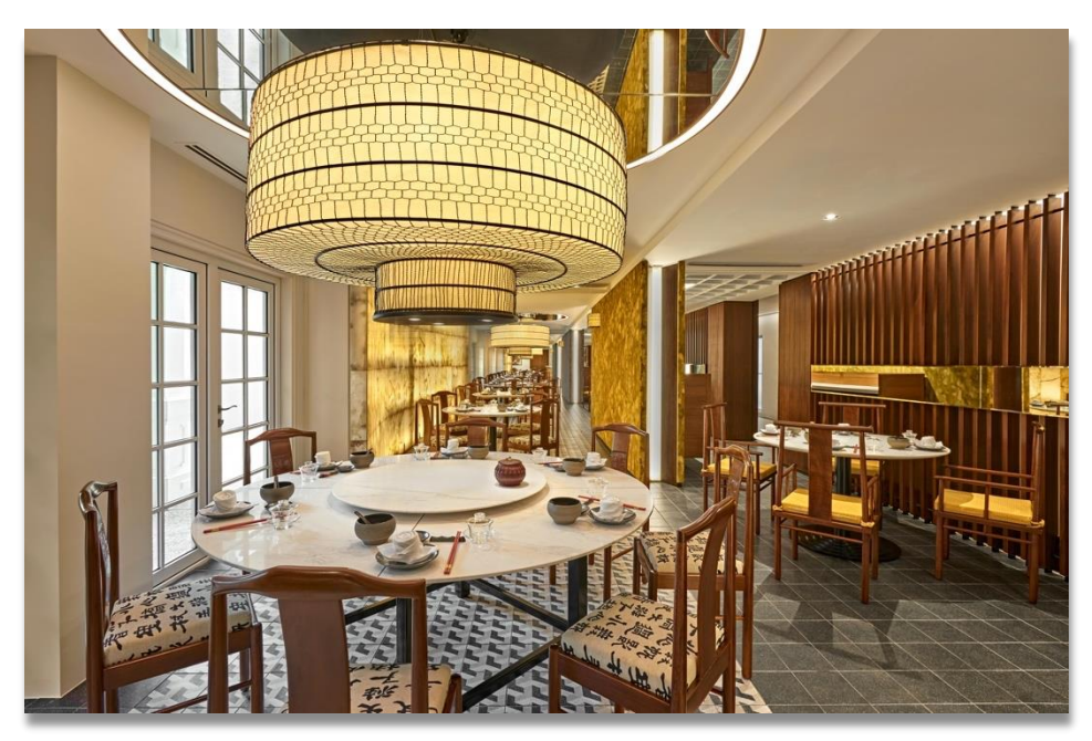
Main dining hall of Min Jiang

Min Jiang marks another milestone in its decades-long history with rejuvenated interiors, refreshed menus & revitalised dining experience