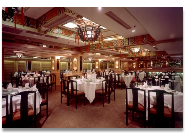
Min Jiang Sichuan Restaurant in the 1980s

Housed in the heritage Goodwood Park Hotel, the esteemed Min Jiang brand has been significant in the grand dame's illustrious history and reputation of pioneering firsts. In 1982, the Hotel opened Min Jiang Sichuan Restaurant alongside Garden Seafood Restaurant, and in 1989 introduced Chang Jiang Shanghai Restaurant, a novel concept to first serve Chinese food, French-style from a side servery. The merger of all three restaurants took place in 2004, transforming them into today's flagship restaurant, Min Jiang, lauded for its outstanding food, service and resplendent setting.