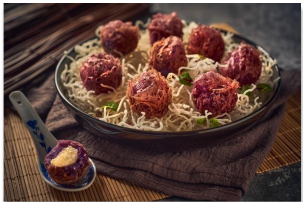
Deep-fried Purple Sweet Potato Crispy Milk