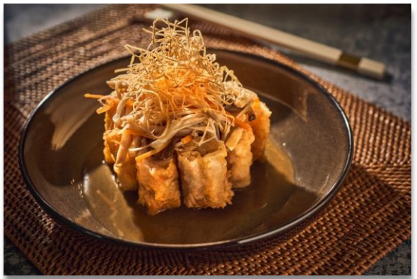
Deep-fried Stuffed Dough Sticks with Shredded Abalone and Enoki Mushrooms

Newly minted dishes articulate Chef Chan's culinary mastery and pursuit for creating new taste profiles built on familiar flavours. The Deep-fried Stuffed Dough Sticks with Shredded Abalone and Enoki Mushrooms 锦绣鲍丝酿油条 elevates the enjoyment of eating crispy dough fritters stuffed with minced seafood paste by adding a deeply savoury sauce and strips of Australian abalone, carrot and mushrooms, topped with deep-fried julienned leeks. The Roasted Chicken Skin with