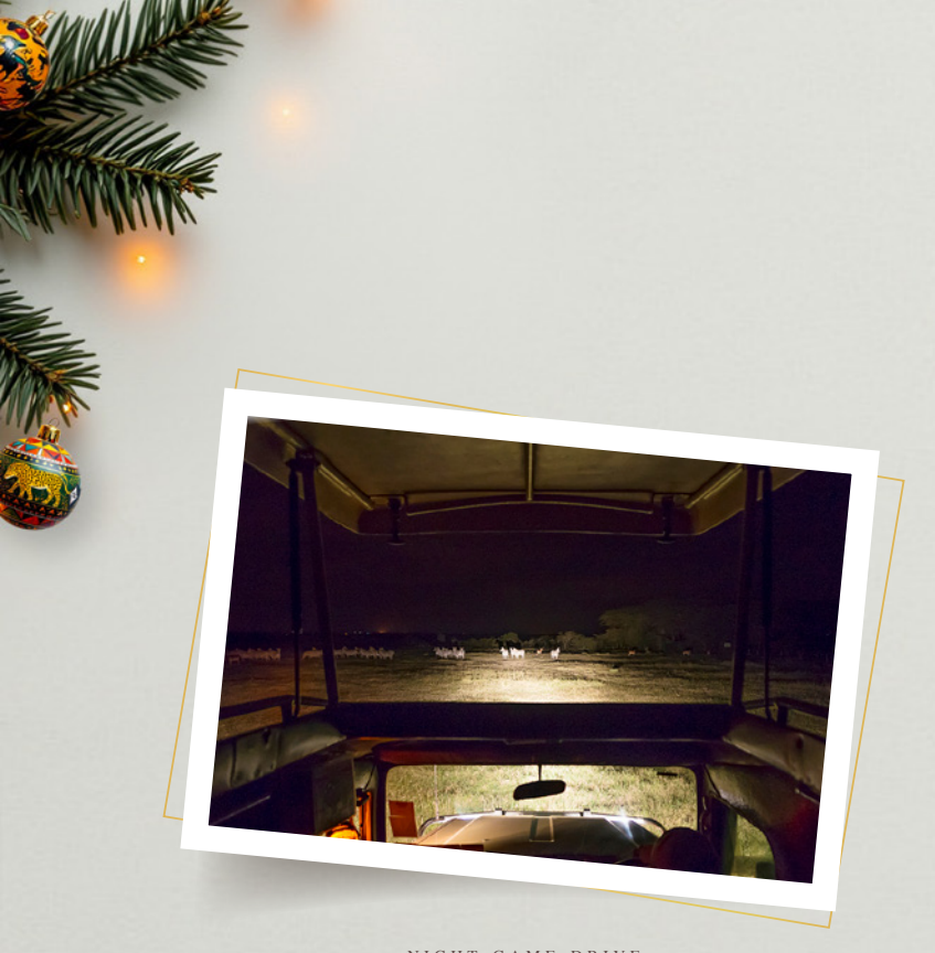
NIGHT GAME DRIVE