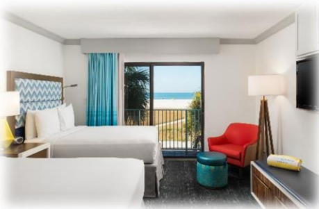
Beachfront Premium Studio w/ Balcony and Kitchen