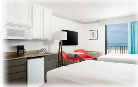
Beachfront Studio w/Balcony