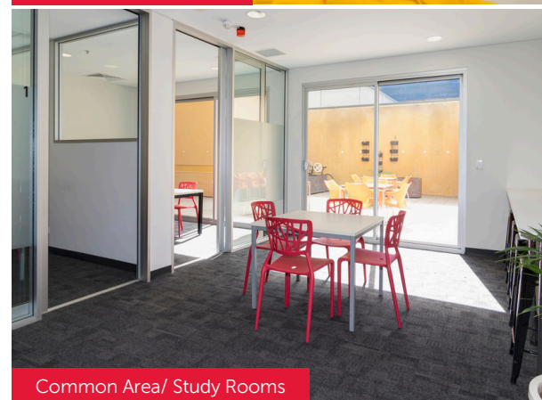
Common Area/ Study Rooms