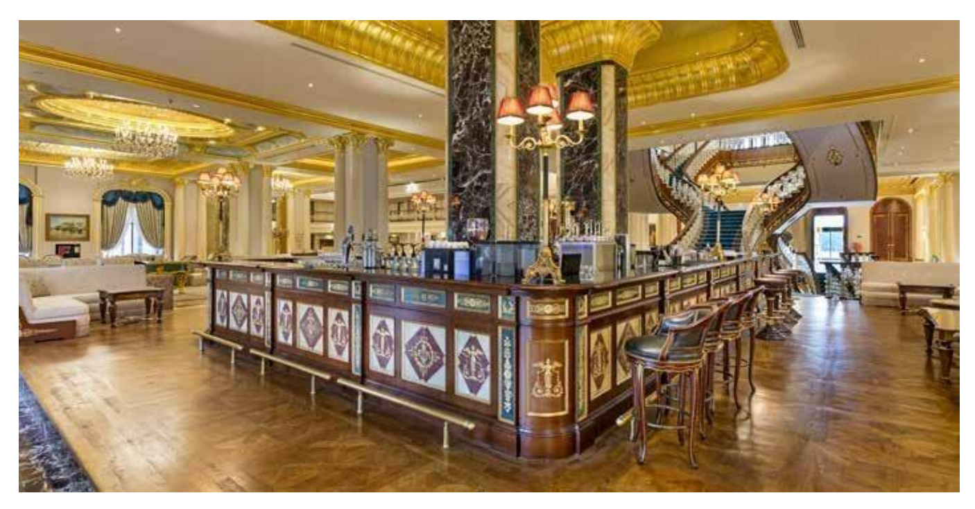
BARS SUMMER SEASON