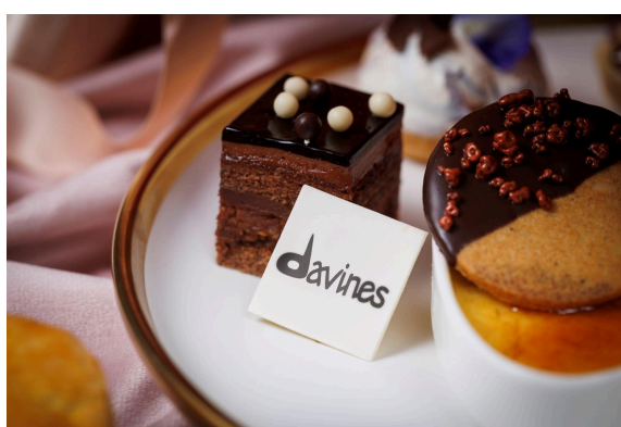
Dark Chocolate Marquise (left); Gingerbread with Crème Brûlée (right)