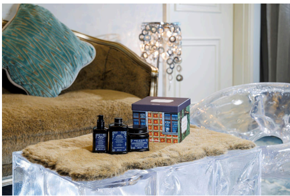
Heart of Glass Gift Box