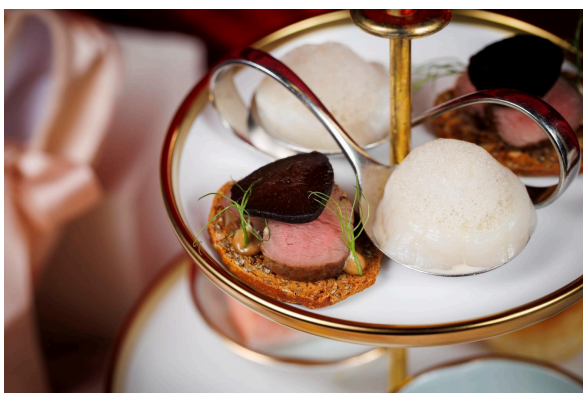
Roasted Black Angus Beef (left); Marinated Hokkaido Scallop with Soy Foam (right)

Freshly-baked Cranberry Scones served with clotted cream and homemade Drottning sylt (Queen's Jam) round off this afternoon tea experience perfectly.