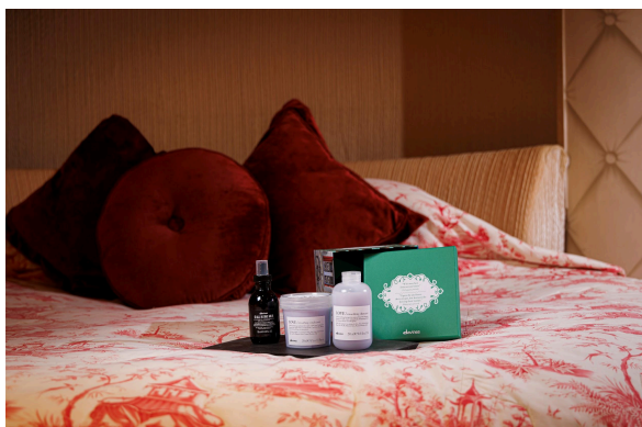
LOVE Smoothing Gift Box