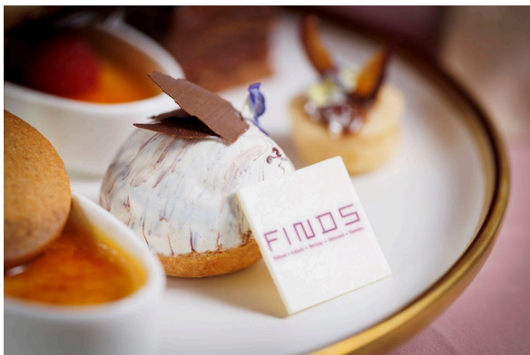
Arabica Coffee Puff