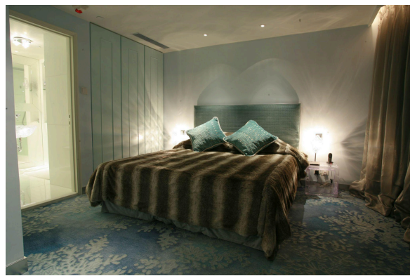
Themed Suite - NORDIC