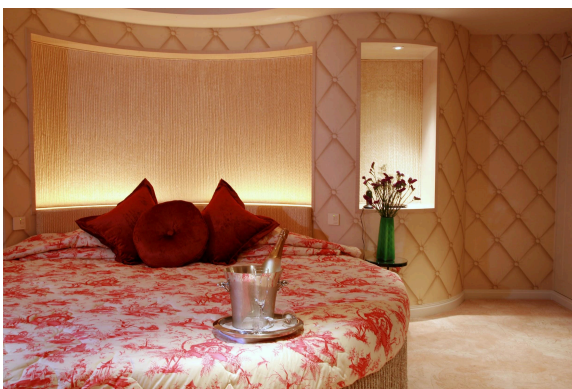
Themed Suite - LIAISON