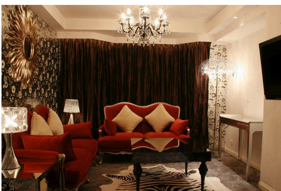
Themed Suite - ROYALE