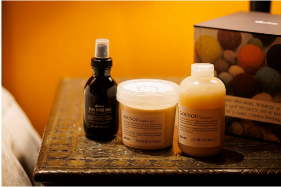
NOUNOU Gift Box