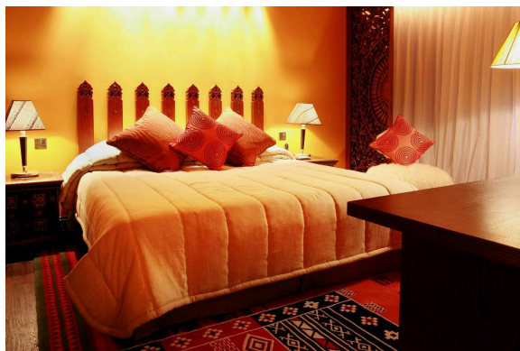
Themed Suite - SAFARI

For enquiries or reservations, please contact the Reservation Department at (852) 3763 8880 or email to rsvn@theluxemanor.com for further assistance.