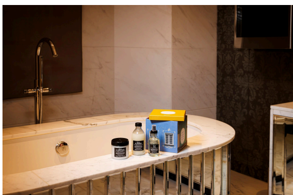
OI Gift Box