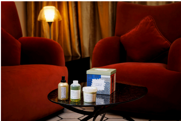
MOMO Gift Box