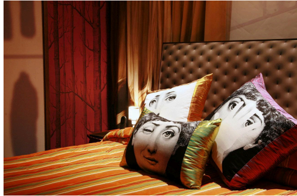
Themed Suite - MIRAGE