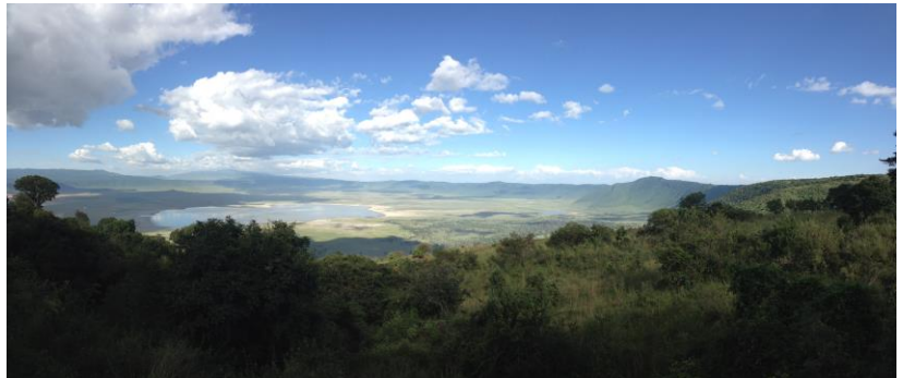
View of the Ngorongoro Crater, Tanzania

Located in Northern Tanzania just west of Arusha lies the Ngorongoro Crater – the world’s largest inactive caldera. Over 2.5 million years ago, the Crater was known as a volcanic mountain rumoured to be taller than Mount Kilimanjaro, making it the highest mountain in all of Africa. The collapse of the peak created the giant caldera, which is now inhabited by over 25,000 animals and 5 different types of landscapes. Within the Crater, one can find forests, plains, savannahs, lakes and hills.