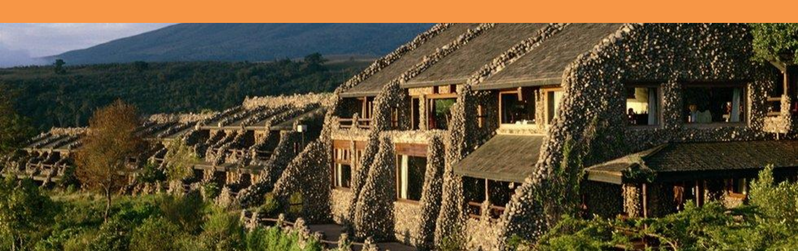
Long and low, the Ngorongoro Serena Safari Lodge (NSSL) is built from local river stone, and camouflaged with indigenous vines, as is entirely invisible from the floor of the Crater 600 meters below. Designed to blend completely into the landscape, a hundred years on a magnificent Fig Tree (Scientific Name: Ficus Thonningii ) lives on thanks to Management's decision to invest in re-designing the footprint of NSSL around this enormous tree.