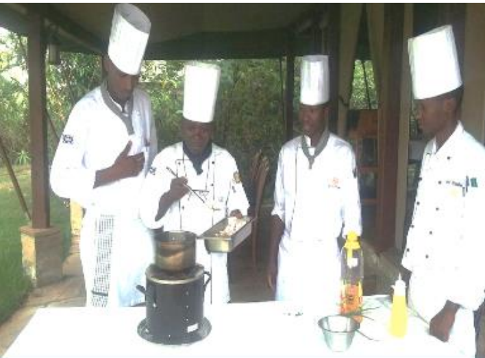
Cooking Class at Lake Elmenteita Serena Camp, Soysambu Wildlife Conservancy, Kenya