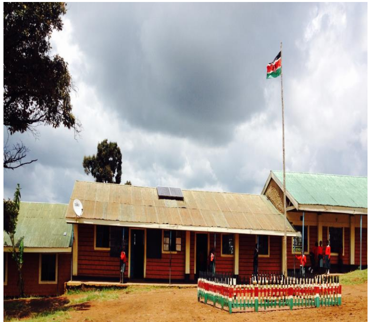
Isokon Primary School in Maasai Mara