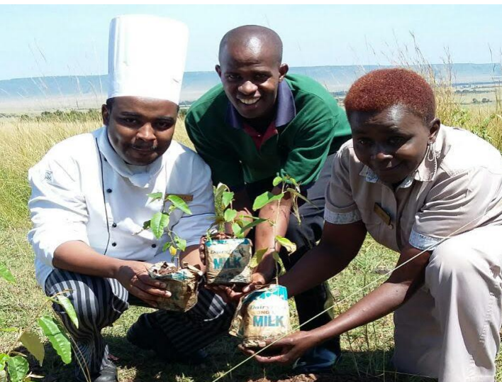
Tree Planting at Mara Serena Safari Lodge, Kenya

Earth Hour is an initiative started in 2007 in Sydney, Australia by the World Wildlife Fund (WWF). The initiative promotes individuals and groups globally to partake in building awareness on climate change by participating in various environmental activities to promote the cause.