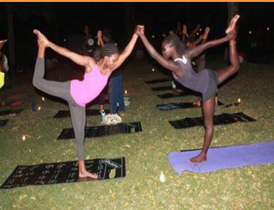
Candlelight Yoga Session with Africa Yoga Project at Nairobi Serena Hotel, Kenya