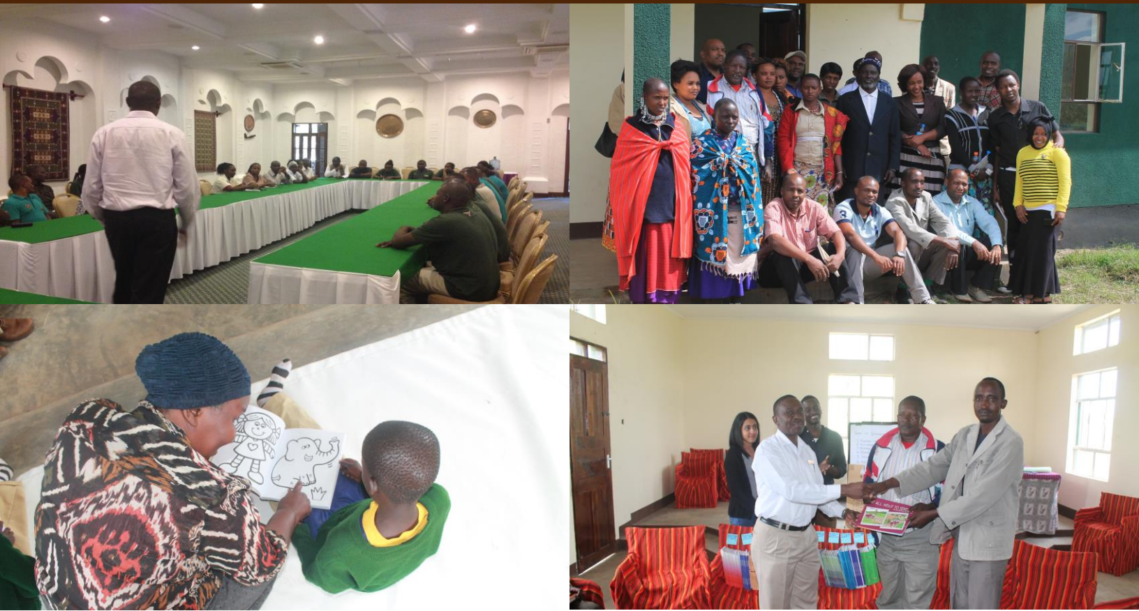
Top Left to Bottom Right: (1) Reading for Children (RFC) Staff Workshop at Serena Beach Resort & Spa, Mombasa, (2)(3)(4) Reading for Children (RFC) Community Workshop at Olorobi Primary School by Ngorongoro Serena Safari Lodge

In 2016 Serena Hotels, in partnership with the Aga Khan Foundation (AKF), Madrasa Early Childhood Program (MECP) and Lions International, expects to expand its milestones from the 19 Community Libraries in Kenya that were launched in 2015 to a total of 23 more libraries across Kenya, Tanzania and Uganda.