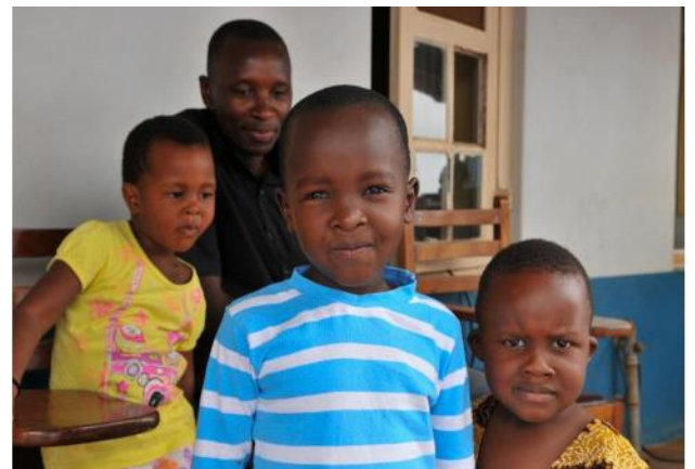
Children from the Valentine’s Day Initiative at the Mwana Mugimu Malnutrition Center, Uganda