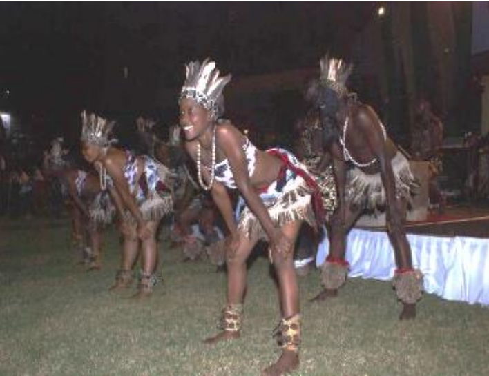
Live Performance at Dar es Salaam Serena Hotel, Tanzania