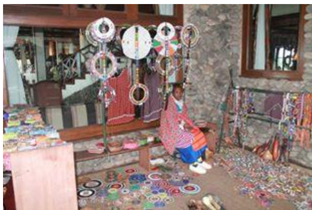
Mini Maasai Market at Ngorongoro Serena Safari Lodge

Located in the Crater Highlands area of Tanzania lies the Ngorongoro Conservation Area (NCA) – a UNESCO Heritage site. This conservation area is quite unique, as it is a game park site while also inhabited by local tribes – all within one enclosed area. The Maasai tribe is the most popular tribe in NCA.