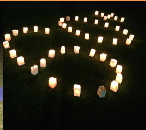
Candles lit at Kampala Serena Hotel, Uganda

Nairobi Serena Hotel partnered with the Africa Yoga Project to hold a candlelight yoga session during the hour in the garden.