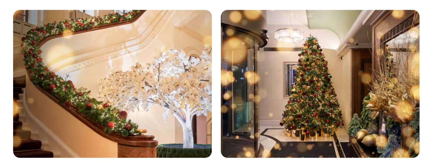
Expect the extraordinary when you join us at The Clermont Charing Cross for Christmas 2024.

From festive celebrations with colleagues, to quality time with family and friends, our stunning hotel promises to offer the most magical place to spend the festive season in London.