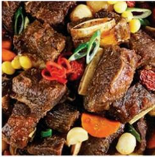
갈비찜 Galbi Jjim Braised Short Ribs