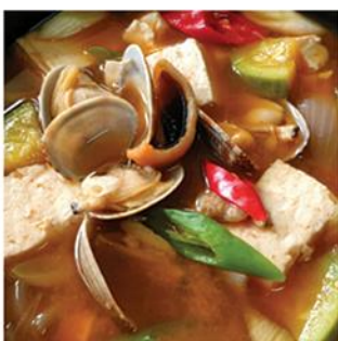
해물 된장찌개 Hamul Doenjang Jjigae Seafood and Soybean Paste Stew