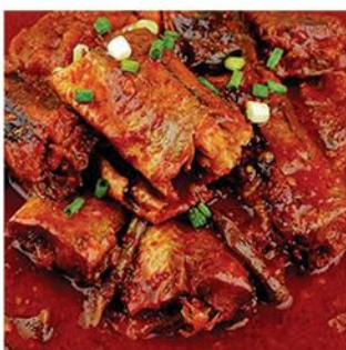
매운코다리찜(맵기선택 가능) Maeun Kodari Jjim(Spicy can be Selected) Spicy braised half-dried pollack