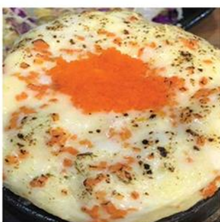
치즈날치알 계란찜 GyeRanJjim Steamed Cheese Flying Fish Roe Eggs