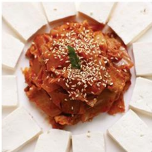
두부김치 Tofu kimchi Handmade Bean Curd and kimchi