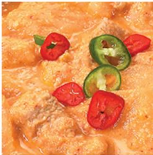
콩비지 찌개 Kongbiji Jjigae Pureed Soybean Stew original traditional style