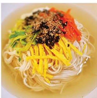
잔치국수 Janchi Guksu Banquet Noodles