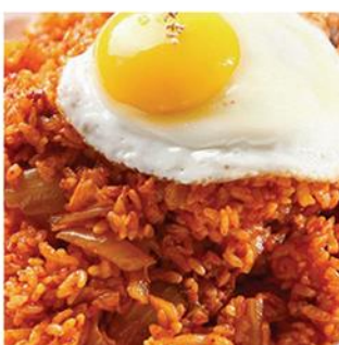
김치볶음밥 Kimchi BokkeumBab Kimchi Fried Rice