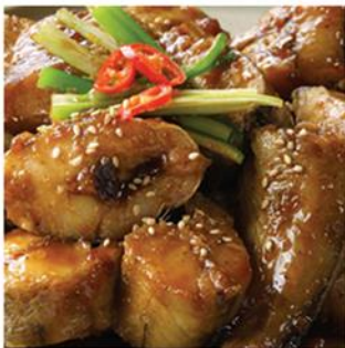
코다리찜 Kodari Jjim Braised half-dried pollack