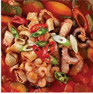
일품 낙곱새 전골(낙지, 곱창, 새우)