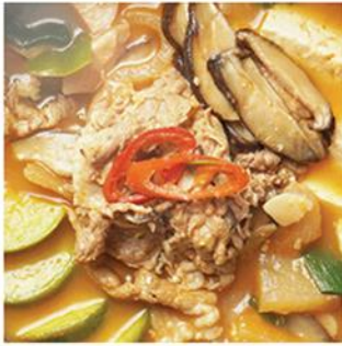
차돌박이 된장찌개 Chadolbagi Doenjang Jjigae Beef Brisket and Soybean Paste Stew