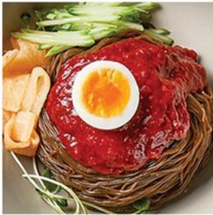
비빔냉면 Bibimnangmyeon Spicy Buckwheat Noodles