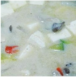
수제두부 들깨탕 Suje Tufu Dulgae Tang Handmade Tufu Perilla Seed Stew