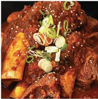
매운갈비찜(맵기선택 가능) Maeun galbijjim(Spicy can be Selected) Spicy braised short ribs