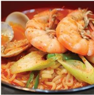
해물 라면 Hamul Ra Myeon Spicy seafood Korean Noodle