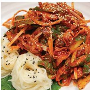
일품골뱅이무침 ILPUM Golbaengimuchim Spicy Sea Snails Salad with Noodles