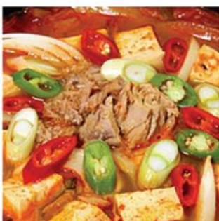
참치 김치찌개 Chamchi kimchi Jjigae Tuna and kimchi Stew