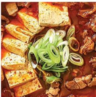
돼지고기 김치찌개 Dwaeji gogi kimchi Jjigae Pork and kimchi Stew