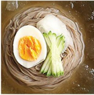
물냉면 Mulnangmyeon Cold Buckwheat Noodles