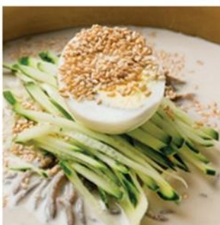
콩국수 Kong Guksu Noodles in Cold Soybean Soup