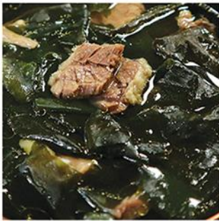
소고기 미역국 Sogogi Miyekguk Beef and Seaweed Soup