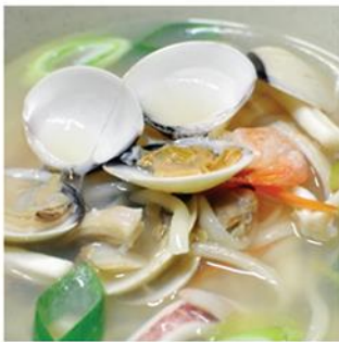
해물 칼국수 Haemul Kalguksu Noodles Soup with Seafood