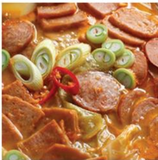
부대찌개 Budae Jjigae Army Stew