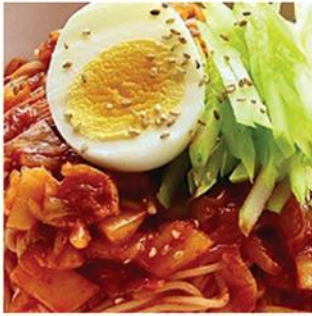
비빔국수 Bibim Guksu Spicy Noodles