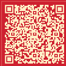
MIN JIANG AT DEMPSEY