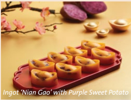
Ingot 'Nian Gao' with Purple Sweet Potato