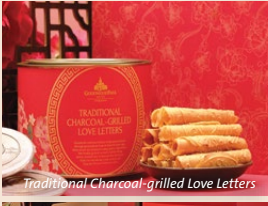
Traditional Charcoal-grilled Love Letters

For the first time ever, Goodwood Park Hotel presents its own take on the beloved kueh bangkit. Delicately crafted to achieve that perfect light and crumbly texture.