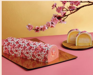
Blooming Prosperity Roll (‘Mao Shan Wang’ Durian Roll Cake) 锦上添花 (猫山王蛋糕卷)