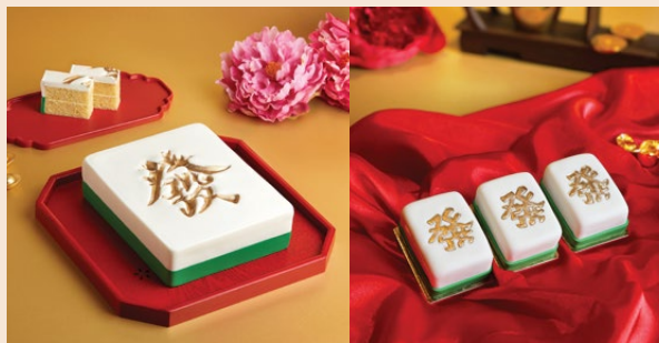
Fortune 'Fa' Cake (Butter Cake) ‘發’ 财蛋糕 (牛油蛋糕)

This luxurious pineapple pound cake is crafted with hand-cut fresh pineapple cubes and aromatic pineapple purée, folded into a perfectly buttery, golden batter.