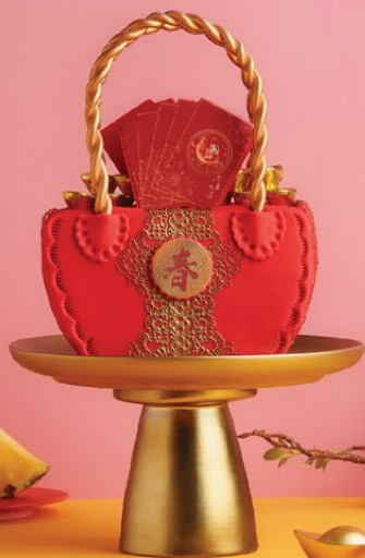
Golden Fortune Bag (Pineapple Pound Cake) 黄金福袋 (黄梨蛋糕)