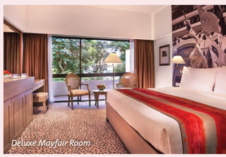
Deluxe Mayfair Room

Dine-in prices are subject to 10% service charge and prevailing government taxes. Pre-payment may be required to confirm bookings for some dates. Not valid with promotions or discounts, unless otherwise stated. Alcohol offers are of selected house labels. Images are for illustration purposes. Some menu items may contain or have come in contact with allergens. Guests may check with our staff for assistance.