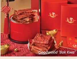
Goodwood 'Bak Kwa'

Relish in the crispness and aroma of this moreish treat from a time-honoured recipe spanning at least 80 years. Each batch is prepared with quality ingredients, including freshly grated coconut, and batter that is slow-cooked over charcoal fire for hours.