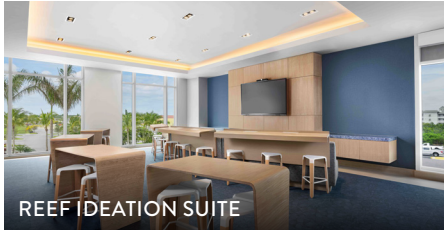
REEF IDEATION SUITE