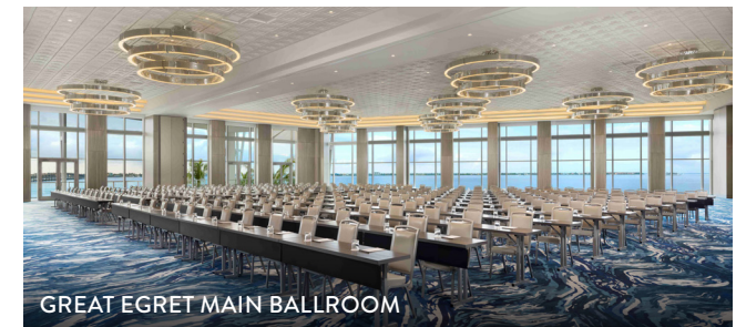
GREAT EGRET MAIN BALLROOM

For additional information or to inquire about hosting your next event at Sunseeker Resort Charlotte Harbor, reach out to sales@sunseekerresorts.com