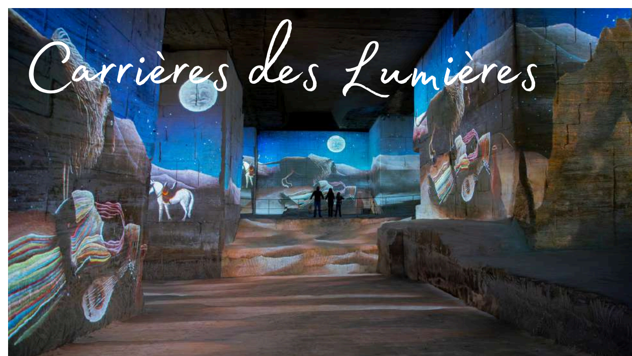
Carrières des Lumières