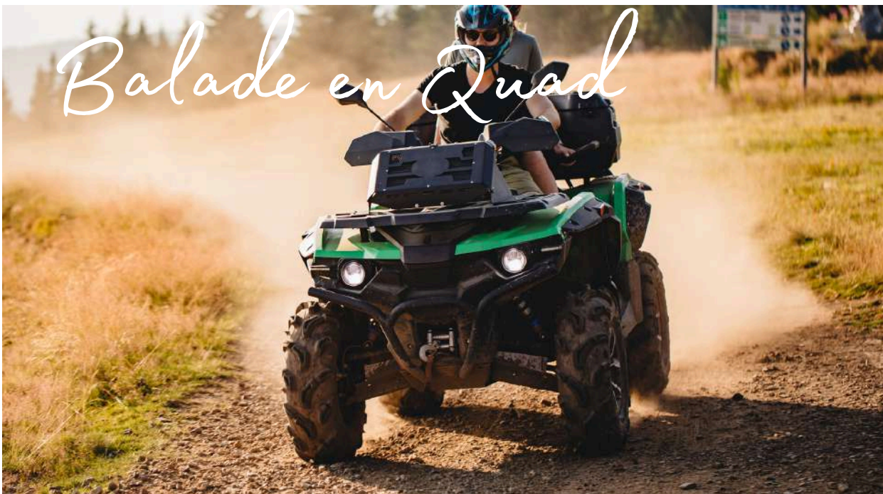
Balade en Quad