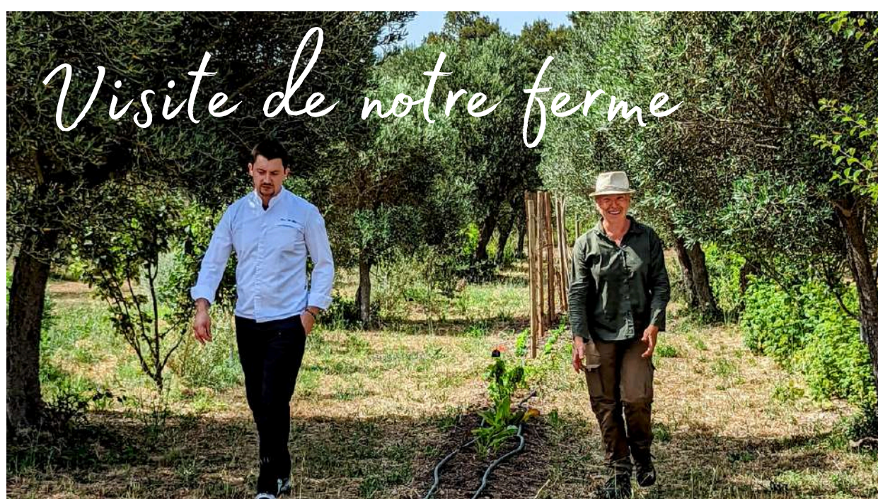
Visite de notre ferme