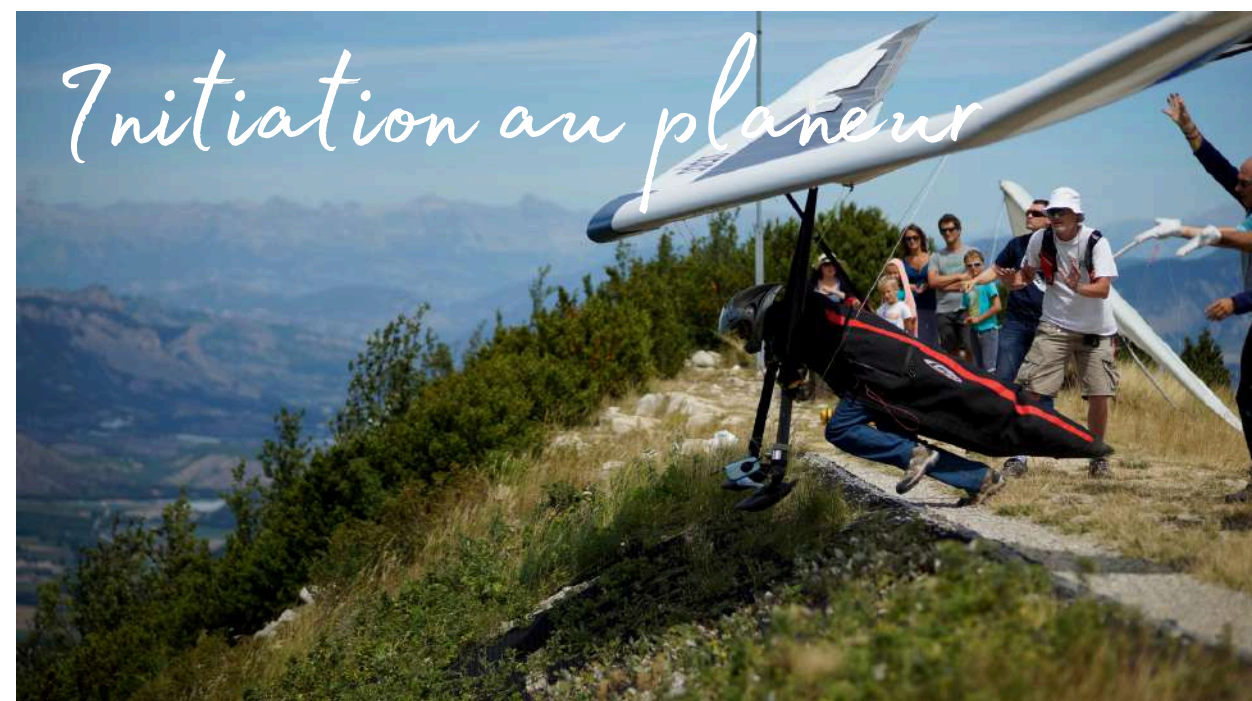
Initiation au planeur