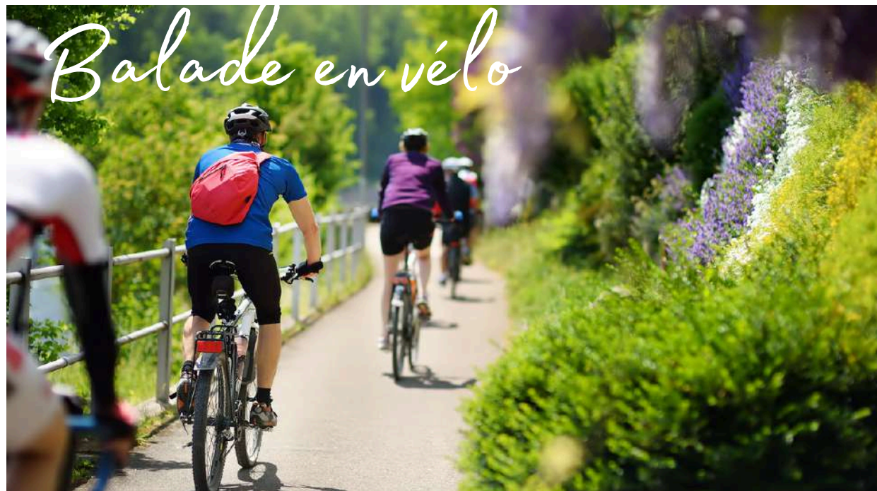
Balade en vélo