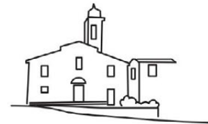
Pieve S. Restituta Winery Montalcino (SI) Year of acquisition: 1994 Surface: 35 ha