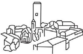
Gaja Winery Barbaresco (CN) Founding year: 1859 Surface: 100 ha

As very proud Ambassadors of the Gaja family we have the luxury to offer you some amazing bottles from their collection. Take advantage of this to discover them by the glass at a very advantageous price.