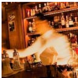
JUST A MOMENT