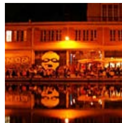
IT'S COMPLICATED: PARIS