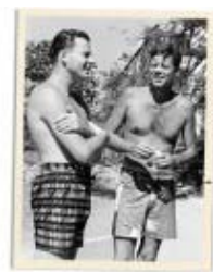
JUST A MOMENT