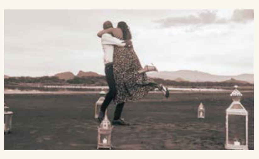
The Diamond Lakeside Weekend

One nights accommodation (inclusive table d'hote breakfast, lunch and dinner/breakfast in bed) in a luxury tent with king-sized bed, double shower, dressing room and private terrace. Welcome wine, fruit and chocolates. Guided walk, yoga, water-colour painting. Game drive, private sundowner with chilled sparkling wine and safari savouries, fully-catered bush dinner for two (menu of your choice), night game drive.