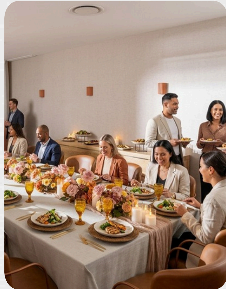
Private @ The Ternary

Take over The Ternary for an unforgettable event, with space for 600 cocktail guests or 200 seated.