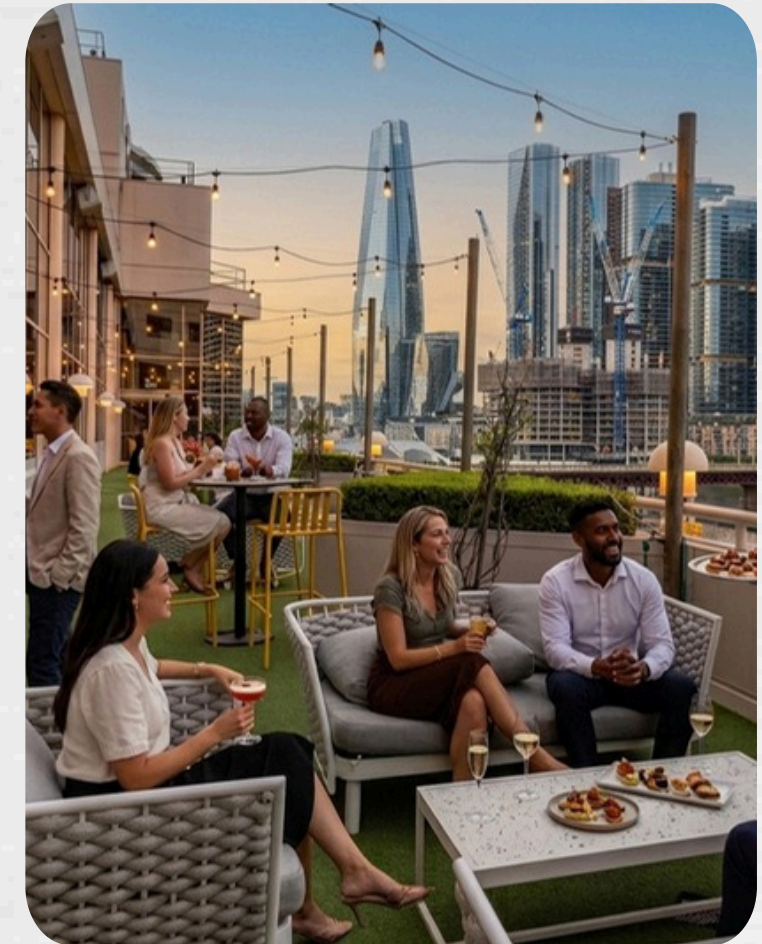
The Ternary Terrace

Overlooking the Sydney skyline, this stylish cocktail venue can host up to 100 guests and offers a flexible setting for both social and business events.