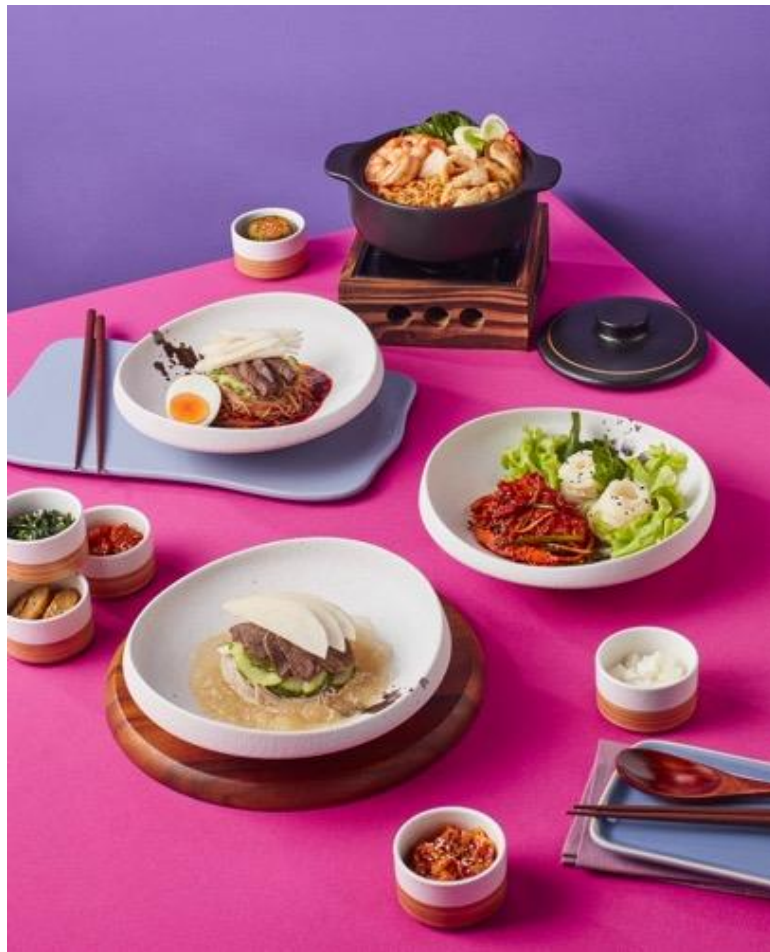
ANJU's 'Seoul Food' Favorites

Whet your appetite with a delectable menu curated by two Korean chefs that ensure tasty, authentic Korean food using traditional recipes and high-quality ingredients. The food selection offers something for everyone: street food favorites such as crispy fried chicken and cheesy tteokbokki to Korean comfort favorites such as Kimchi Jigae, Bossam (boiled pork belly wraps), and spicy seafood ramyun.