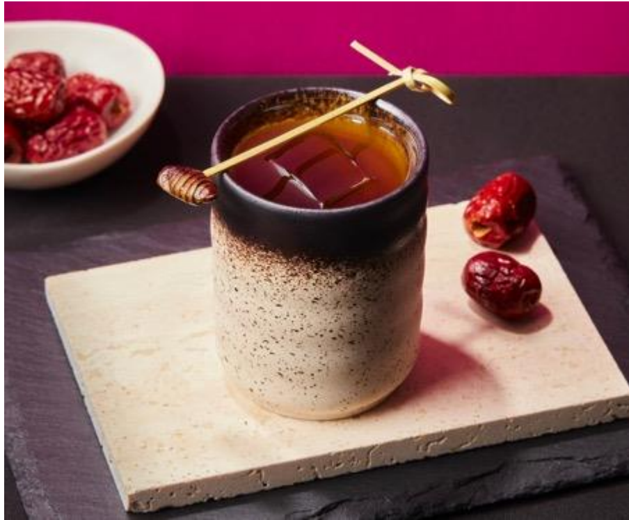
Signature Cocktail - Beon-De-Gi

Excite your taste buds with signature cocktails such as Jjam-Ppong, Yak-Gwa, and Kim-bap, or if you're feeling adventurous, try the Beon-De-Gi, a Korean insect-based street food made with silkworm pupae. Fans of classic cocktails will have plenty to choose from - such as Kosmopolitan (inspired by Cosmopolitan), Ginseng 75 (Inspired by French 75), Medduki (Meaning 'Grasshopper,' inspired by Grasshopper), Seoul Mule (Inspired by Moscow Mule) and many more exciting twists featuring Korean ingredients and spirits to transport you to Gangnam.