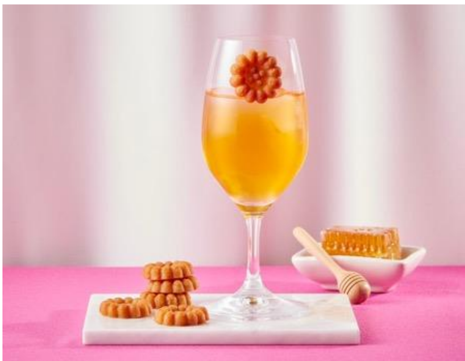
Signature cocktail - Yak-Gwa

After feasting on ANJU's mouthwatering menu, it's time to get in the mood to dance or party the night away with ANJU's selection of innovative signature and classic cocktails with a Korean twist. Explore the signature cocktails from the creation of Benyapa Gongrum, inspired by popular Korean food and classic twists that put a Korean spin on classic cocktails.