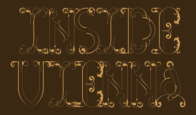
GO LOCAL WITH THE MOTTO-CREW

Naturally, we think our hood the finest of the city. But admittedly, Vienna has a few more tricks up its sleeve than just the 6th and 7th district. Therefore, here comes the MOTTO crew's secret recommendations for urban adventures in the most beautiful city in the world – curated exclusively for you.