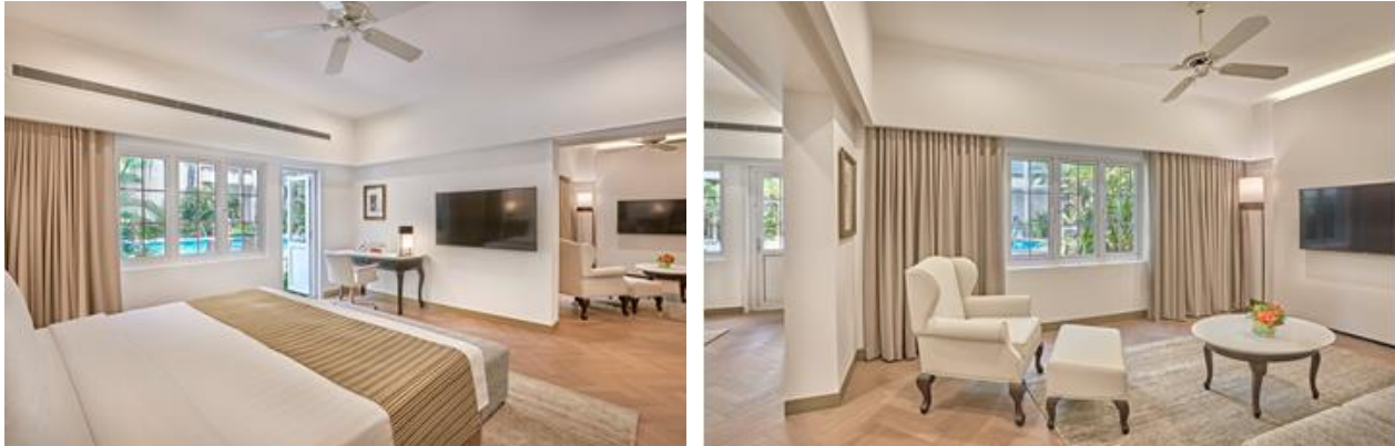
From left to right: Deluxe Poolside Suite's Bedroom and Living Room

A tranquil experience awaits in the charming haven of the Deluxe Poolside Suites which offer direct access to the hotel's discreetly located Balinese-inspired Mayfair Pool. Each suite is decadently spacious with a separate living room and two bathrooms that offer standing showers, and one with an additional bathtub.