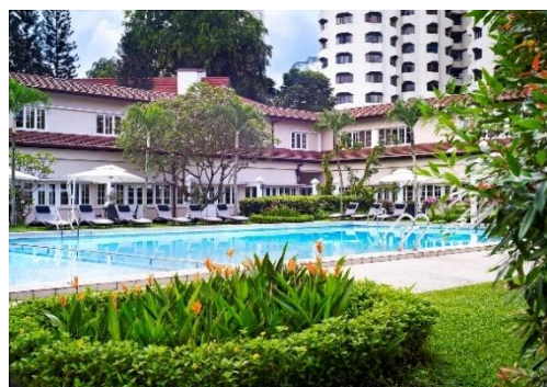
Contemporary-style Main Pool