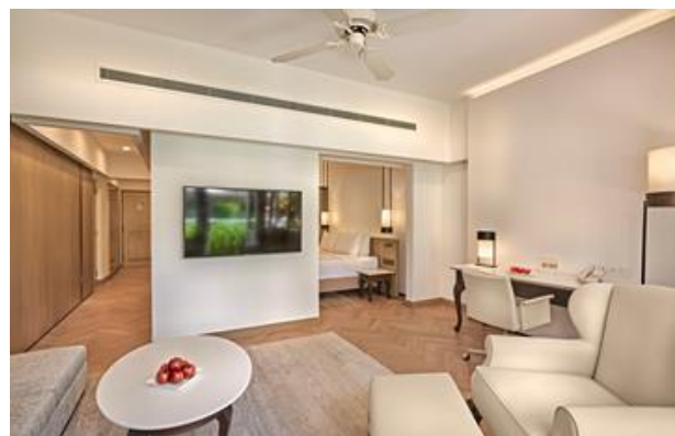
From left to right: Poolside Suite's Bedroom and Living Room