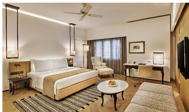
Deluxe Premier Room