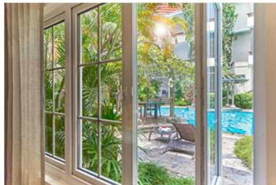
View of the Balinese-style Mayfair Pool from the Deluxe Poolside Suite

A tranquil experience awaits in the charming haven of the Deluxe Poolside Suites which offer direct access to the hotel's discreetly located Balinese-inspired Mayfair Pool. Each suite is decadently spacious with a separate living room and two bathrooms that offer standing showers, and one with an additional bathtub.