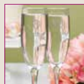
“Bride & Groom” Flutes - $42.39

Set of two “Bride” and “Groom” glass flutes featuring a silver linked hearts design.