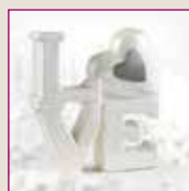
“L.O.V.E.” Cake Topper - $29.68

Your cake will look fabulous with this silver tone, jeweled metal double heart cake topper!