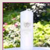
One Love Unity Candle - $42.39

Delicate ribbons adorn this white candle, 9” tall, 3” diameter.