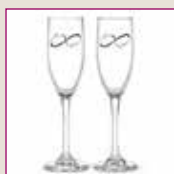
Infinity Flutes - $31.79

Looking for the perfect glasses to toast your marriage? Choose from our selection below.