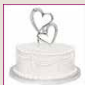
“Two Hearts” Cake Topper - $25.33

These delicate cake toppers add a little something special to your wedding cake. Later, you can put the topper on display in your home to remind you of your wedding memories year-after-year!