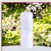
Lace Unity Candle - $26.49

Two become One. The perfect ceremony for your wedding day.