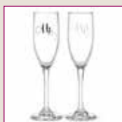
“Mr. & Mrs.” Flutes - $37.09

Set of two glass flutes featuring infinity design with the words “I Do Forever” in black.