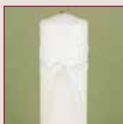
Sweet Unity Candle - $31.79

White candle with satin and lace band, 9” tall, 3” diameter.