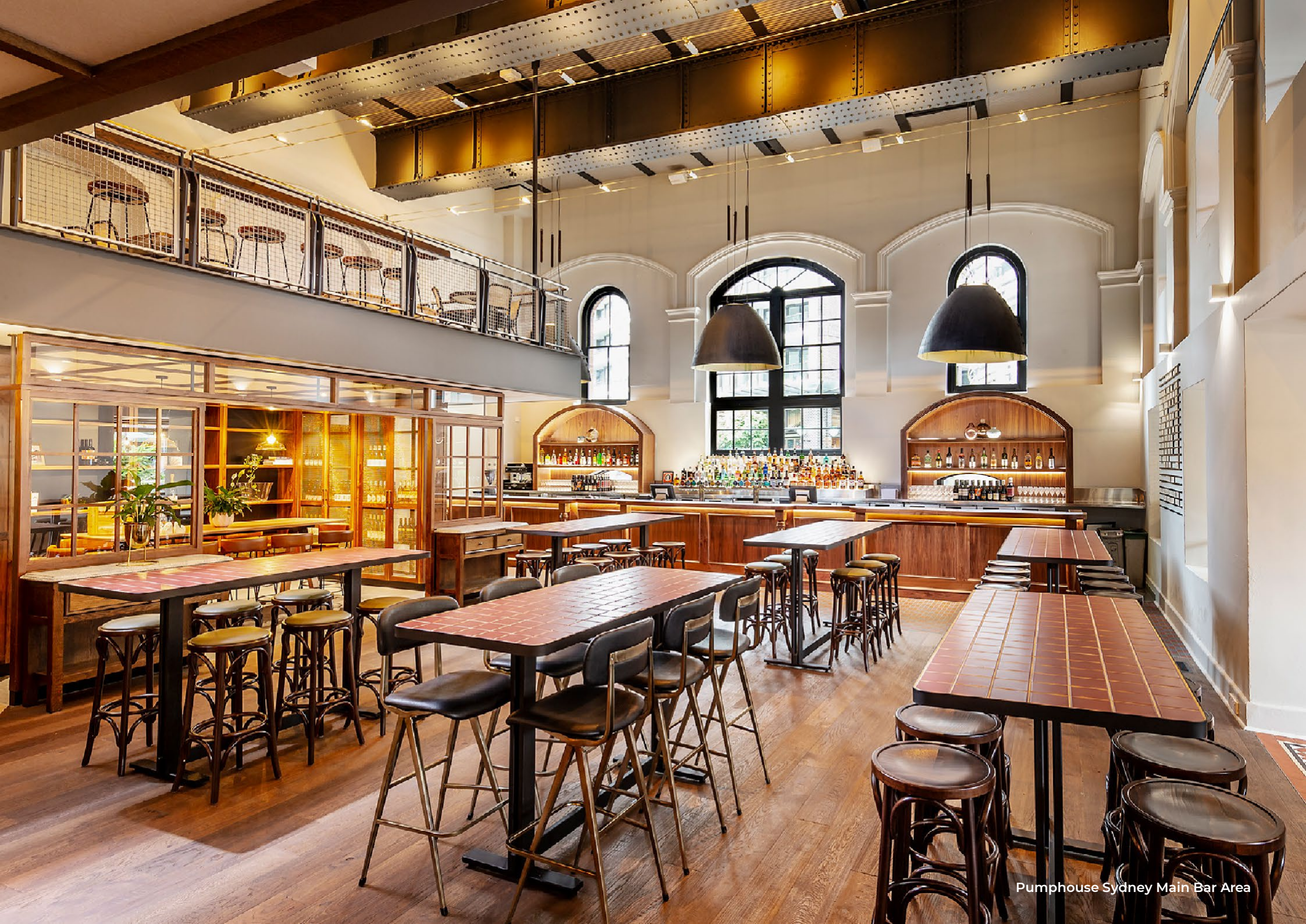
Pumpphouse Sydney Main Bar Area