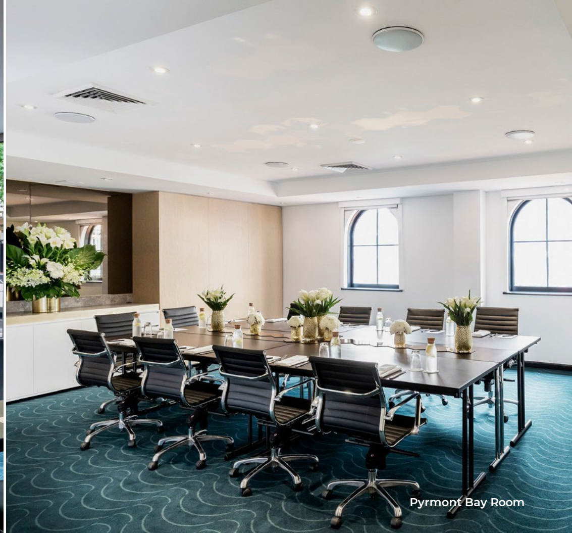
Pyrmont Bay Room