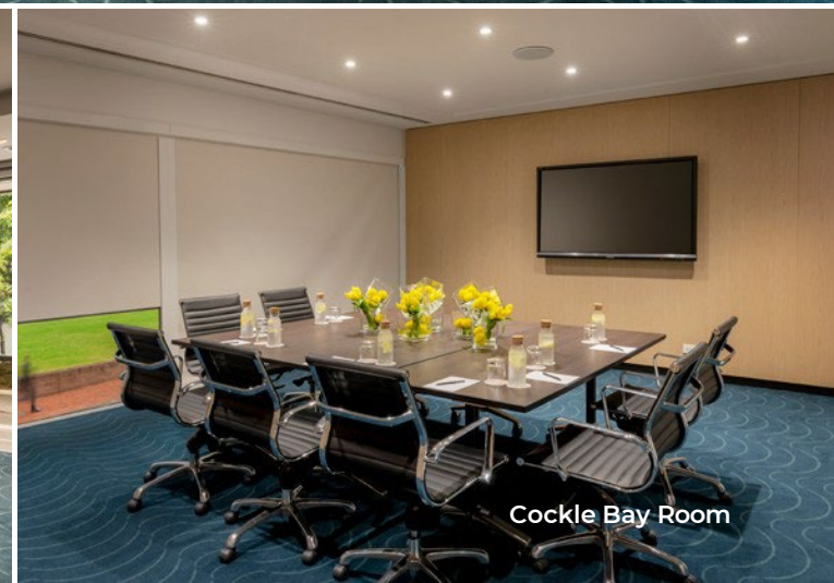
Cockle Bay Room