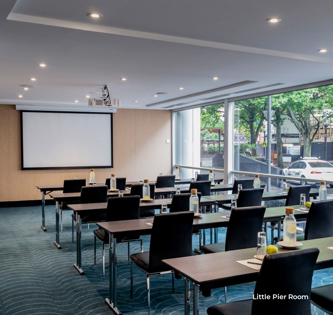
Little Pier Room