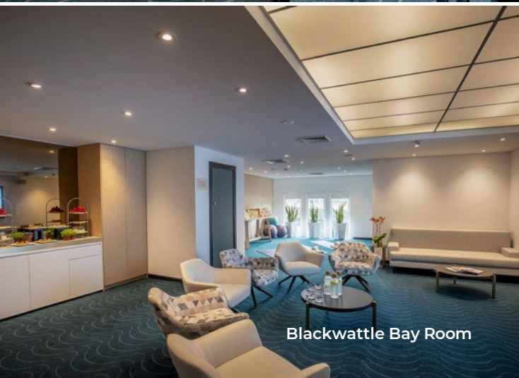
Blackwattle Bay Room