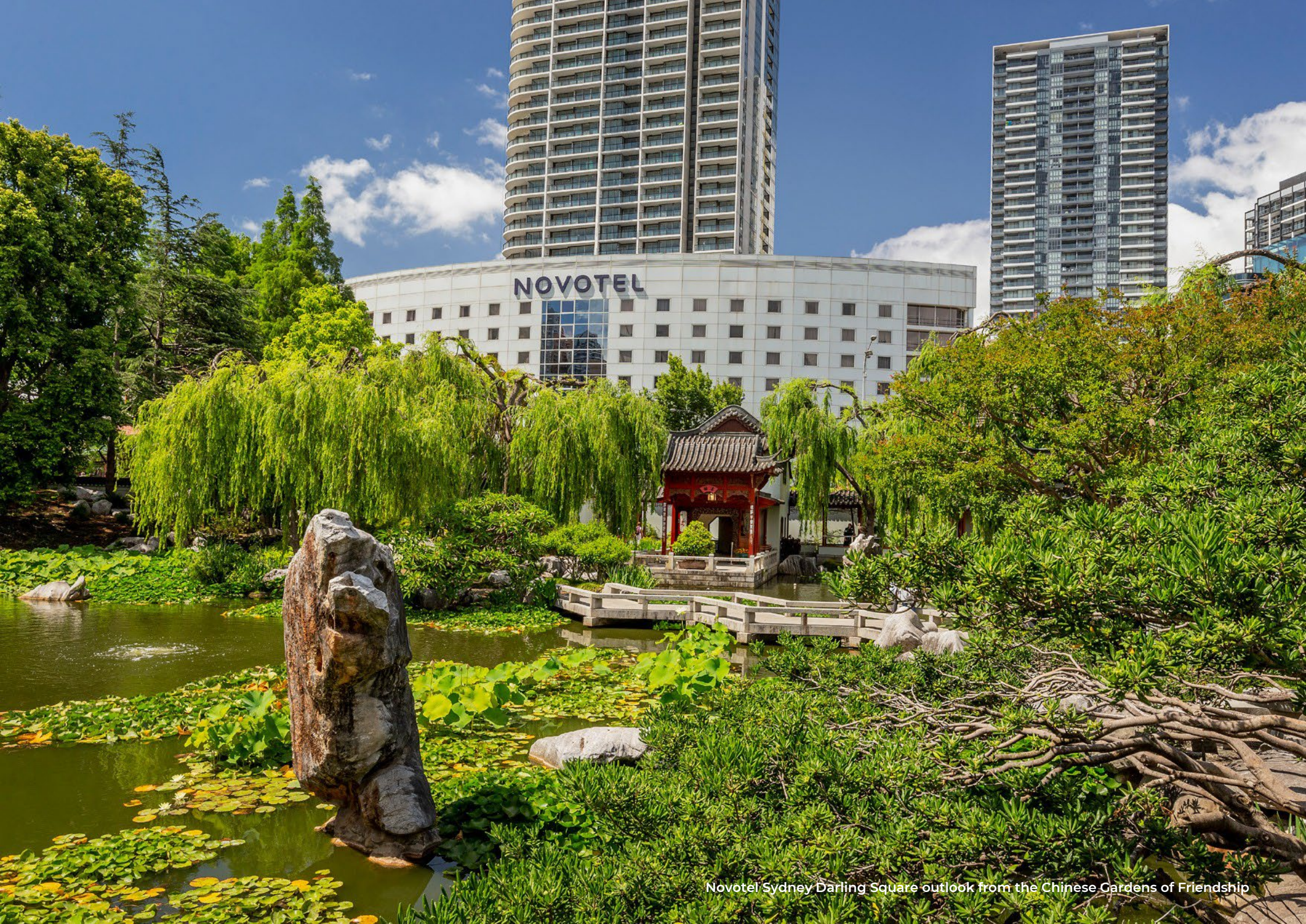
Novotel Sydney Darling Square outlook from the Chinese Gardens of Friendship