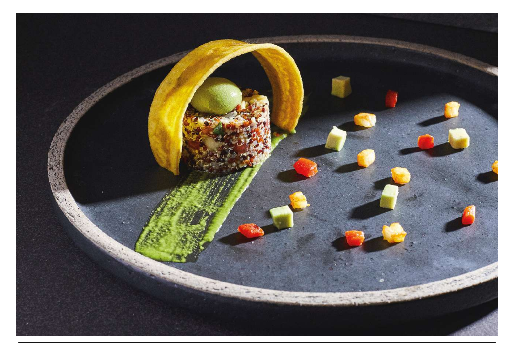
Tasting menu "Flavors of the Andes" Apucc Mikhuna

Duration: 2 hours Capacity: min: 2 | max: 20