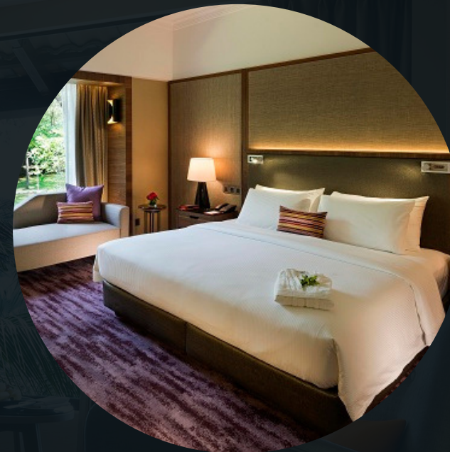
EXECUTIVE DELUXE ROOM