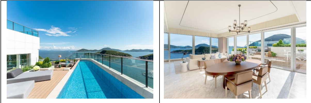
The Fullerton Pool Suite