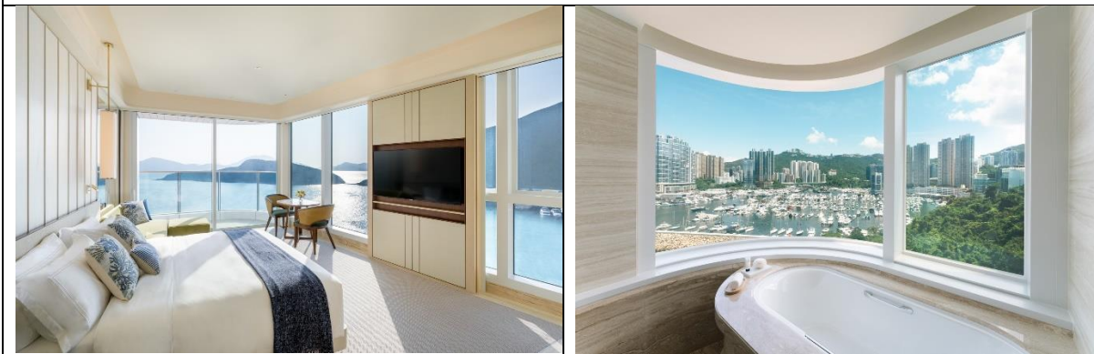
Balcony Oceanfront Lookout