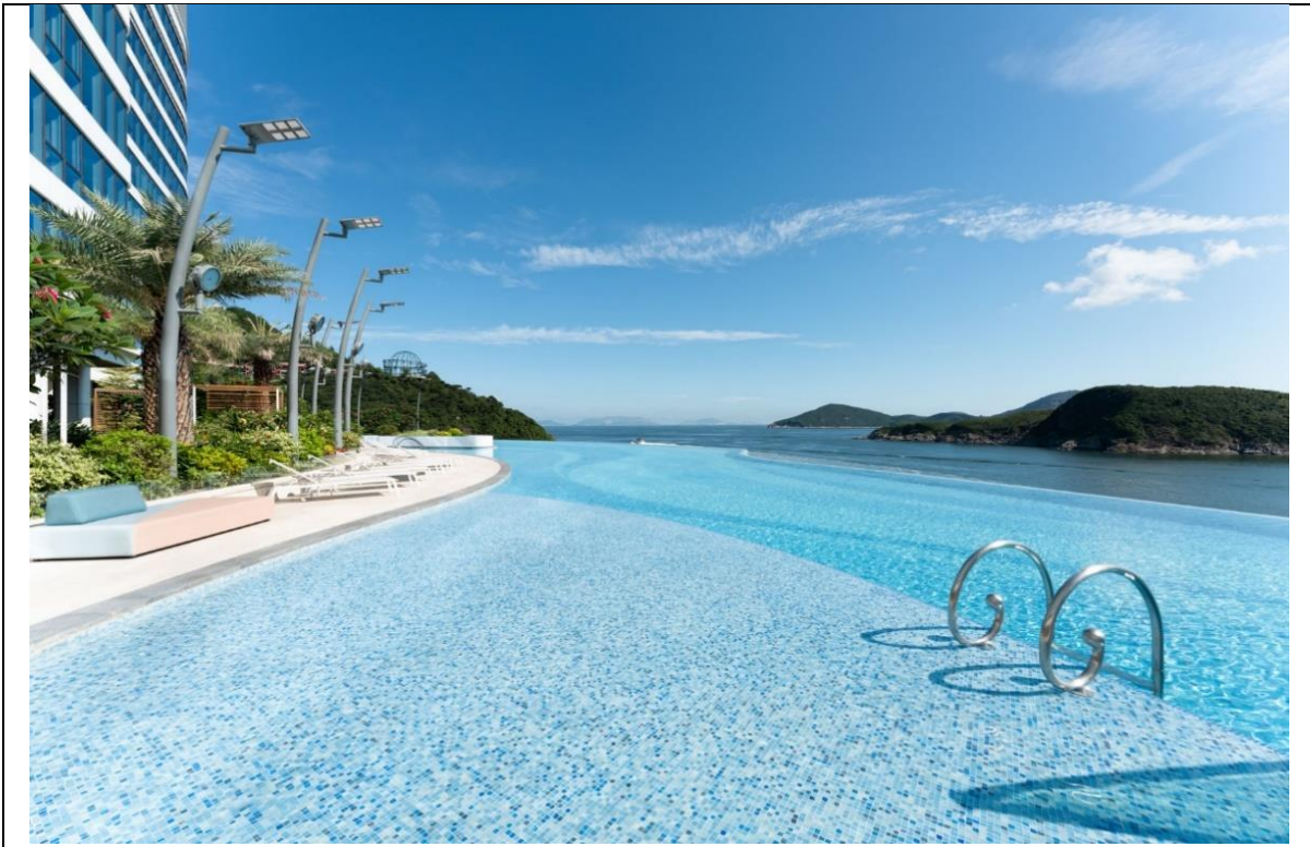
3/F infinity pool overlooking stunning South China Sea