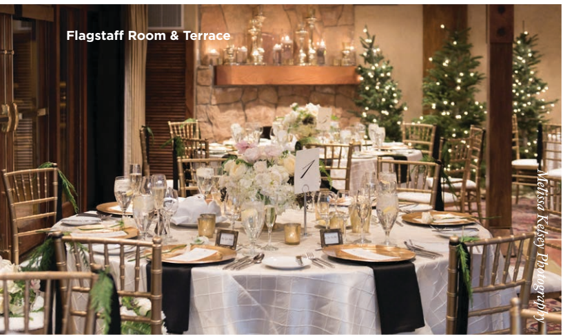
Flagstaff Room & Terrace