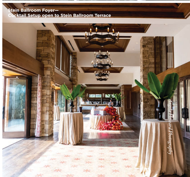
Stein Ballroom Foyer— Cocktail Setup open to Stein Ballroom Terrace