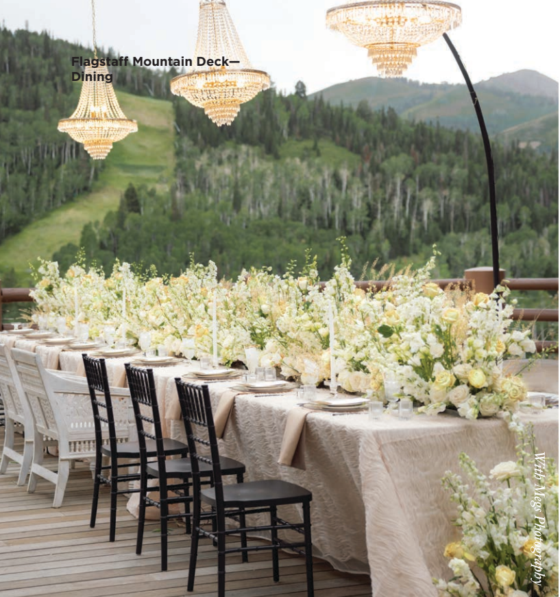
Flagstaff Mountain Deck— Dining