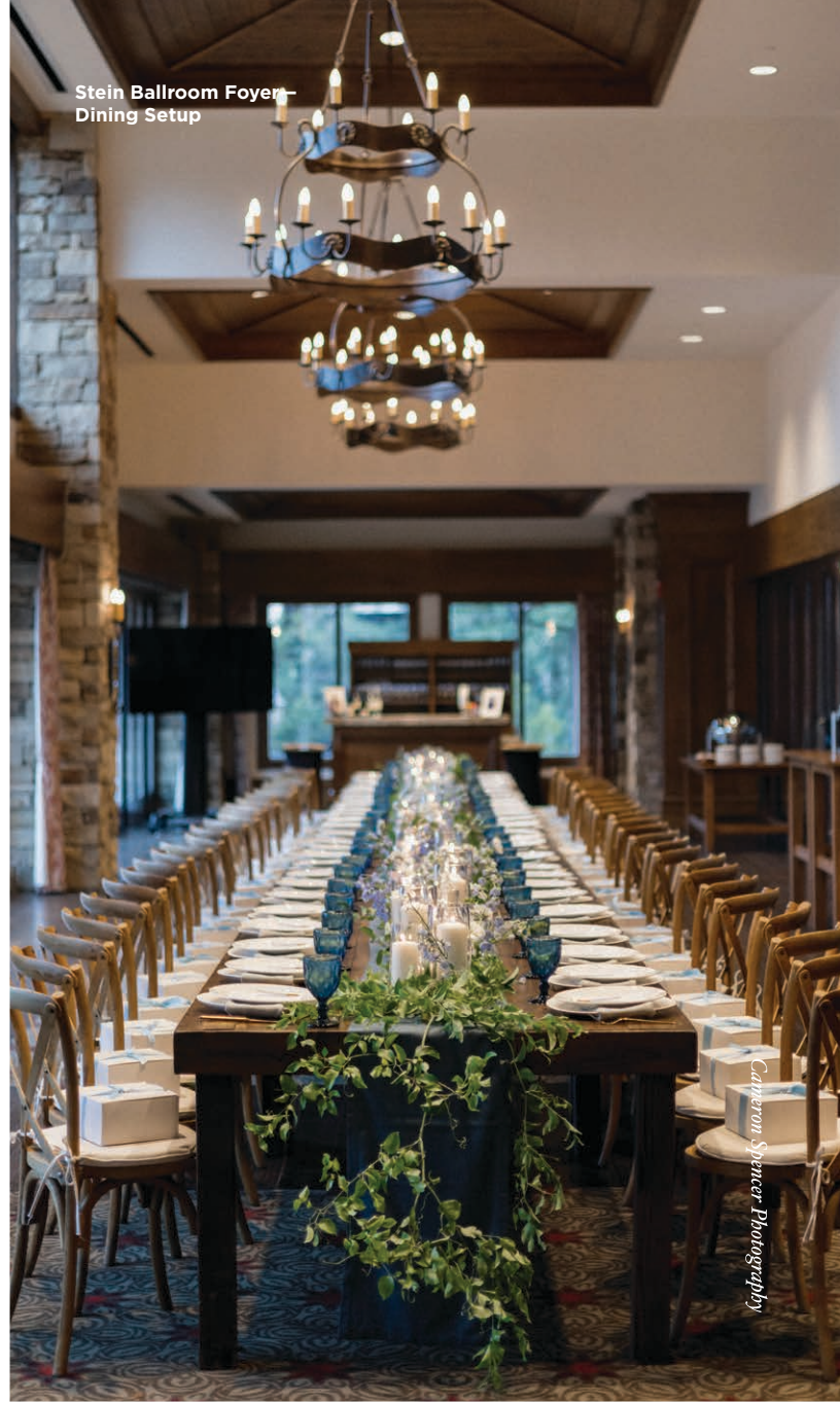
Stein Ballroom Foyer— Dining Setup