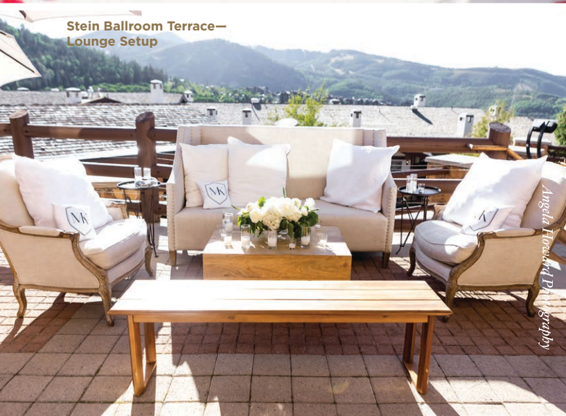
Stein Ballroom Terrace— Lounge Setup