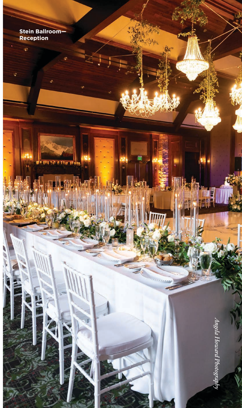
Stein Ballroom— Reception