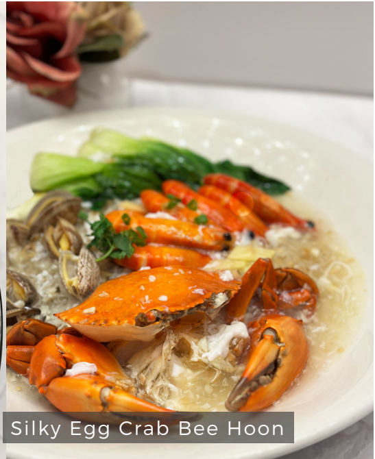
Silky Egg Crab Bee Hoon