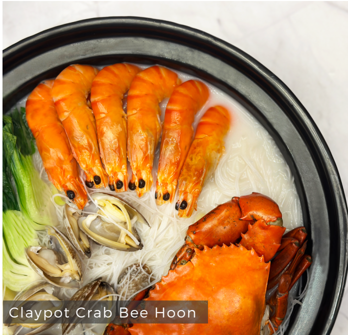
Claypot Crab Bee Hoon