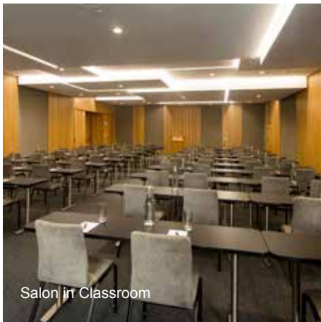
Salon in Classroom