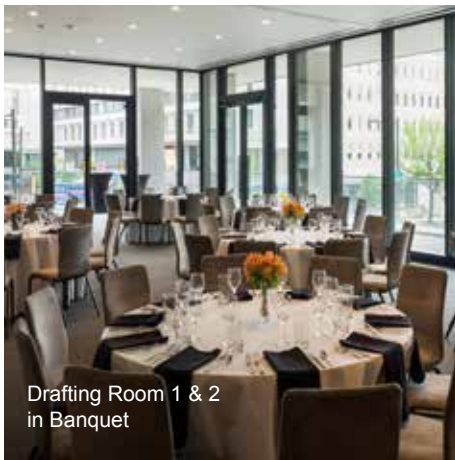
Drafting Room 1 & 2 in Banquet