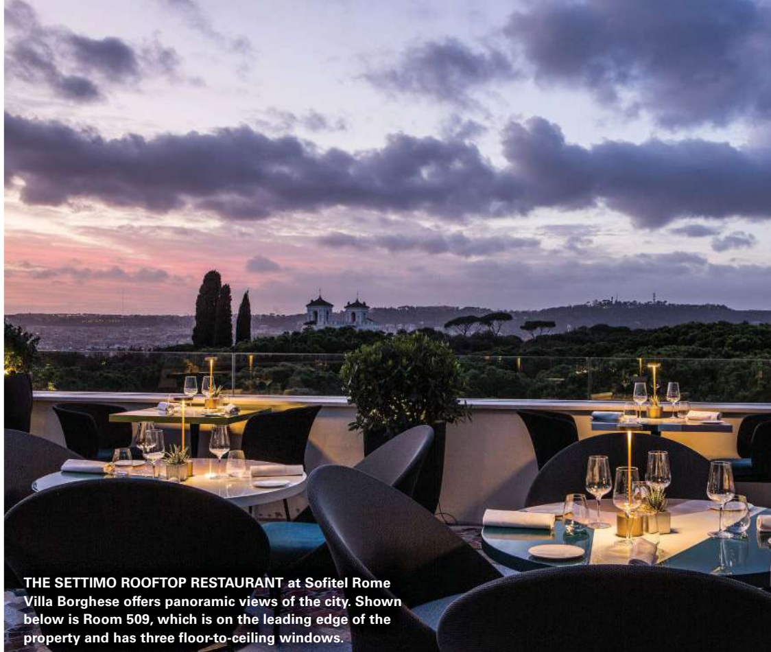
THE SETTIMO ROOFTOP RESTAURANT at Sofitel Rome Villa Borghese offers panoramic views of the city. Shown below is Room 509, which is on the leading edge of the property and has three floor-to-ceiling windows.

The décor is not fussy, but is well done with clean modern lines and no tchotchkes littering the tabletops. The family rooms are large. Room 401 came with two double beds and a trundle sleeper sofa. The bathroom was up-to-date and spacious. We were thinking about young families or even a group of gap-year travelers who may not require the same