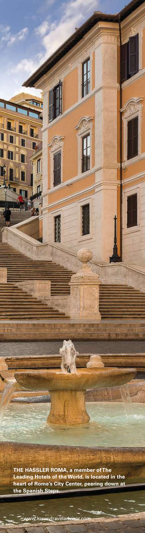
THE HASSLER ROMA , a member of The Leading Hotels of the World, is located in the heart of Rome's City Center, peering down at the Spanish Steps.

As the world steps out after more than a year at home, dedicated travelers are yearning to recapture the pleasures of their first — or 10th — trip to Rome, where perspective is everything. After 2,774 years, the Eternal City has learned to shake off turmoil, never losing her special ambiance.