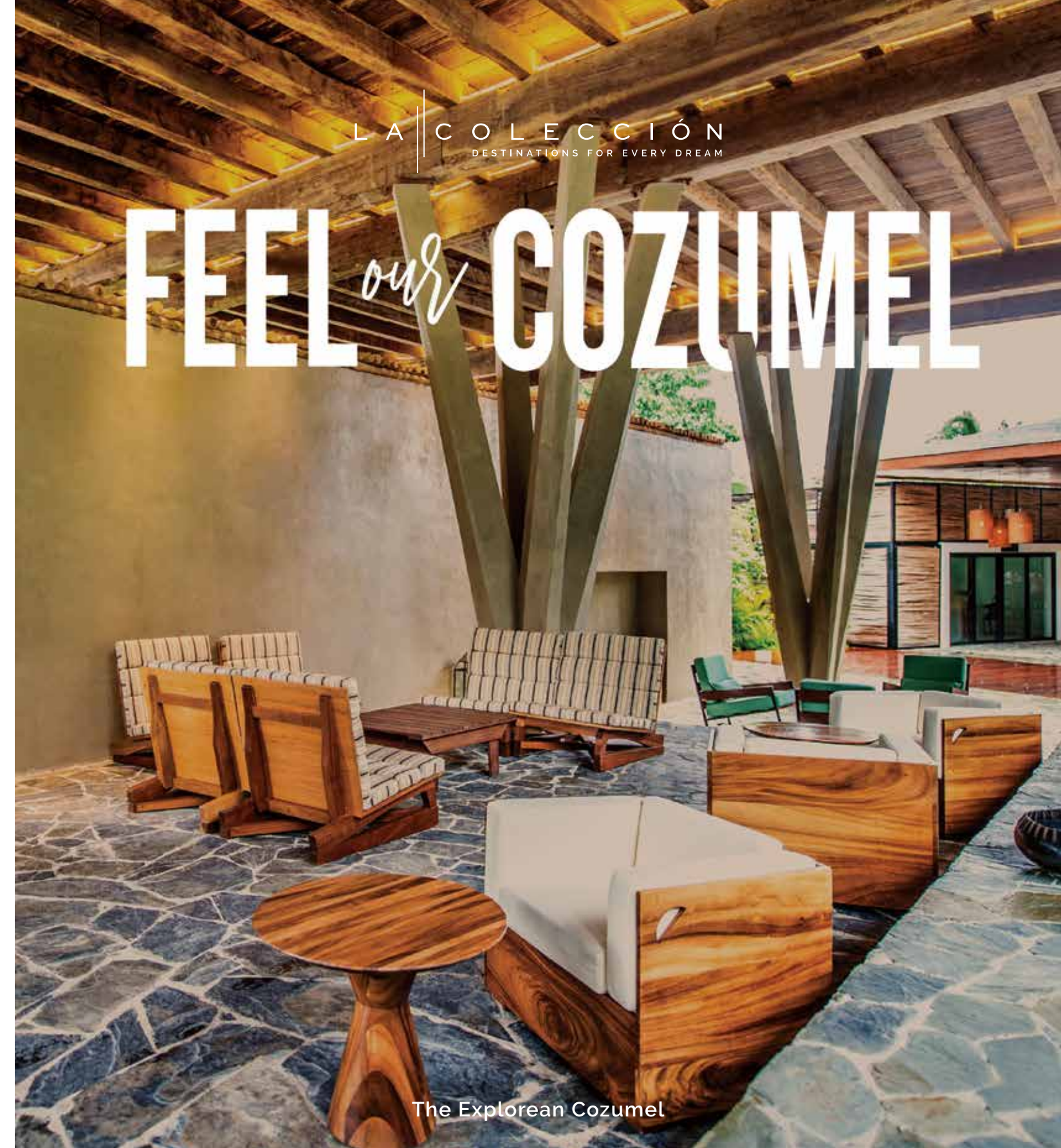
The Explorean Cozumel