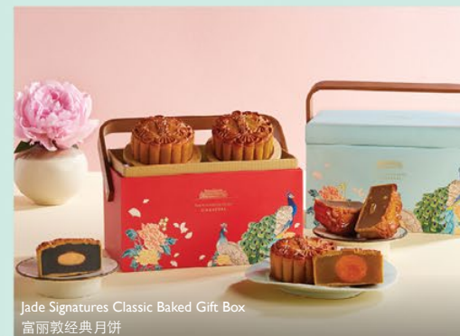
Jade Signatures Classic Baked Gift Box 富丽敦经典月饼