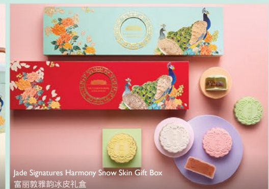
Jade Signatures Harmony Snow Skin Gift Box 富丽敦雅韵冰皮礼盒