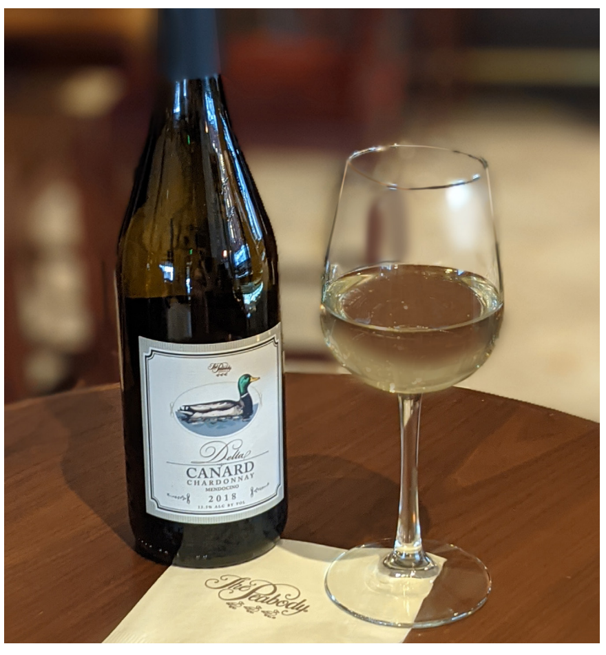
Vintage is subject to availability