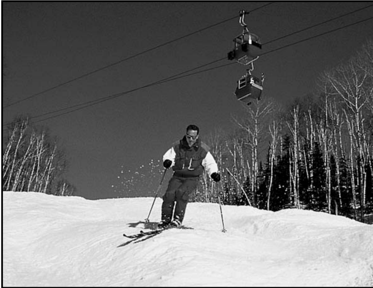
COME JOIN US FOR A FUN WINTER AT BLUEFIN BAY