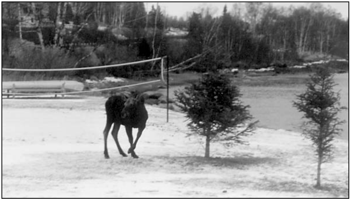
VOLLEYBALL ANYONE? THIS YOUNG MOOSE WAS WANDERING THROUGH BLUEFIN LOOKING FOR A FEW PLAYMATES

Be sure to make your reservations early for our next FOOD & WINE LOVERS Weekend at Bluefin Bay, May 7&8, 2004 featuring the wines and culinary delights of Hess Vineyards, California. The Hess wine maker and culinary staff will come to Bluefin Bay and help the Bluefin Staff in creating a memorable weekend.